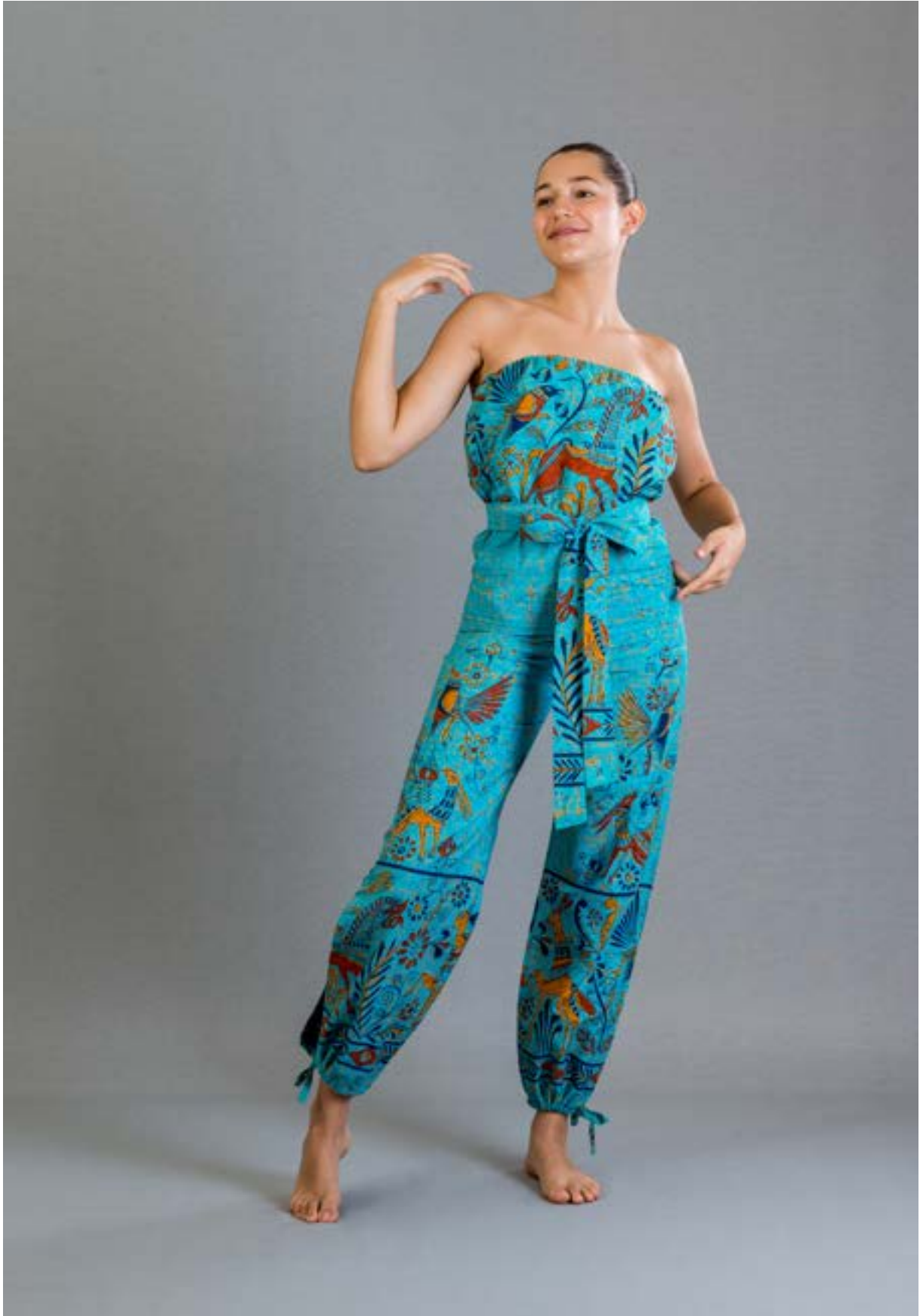
72. Design by Telas Escalera, c. 1966 Cotton batik