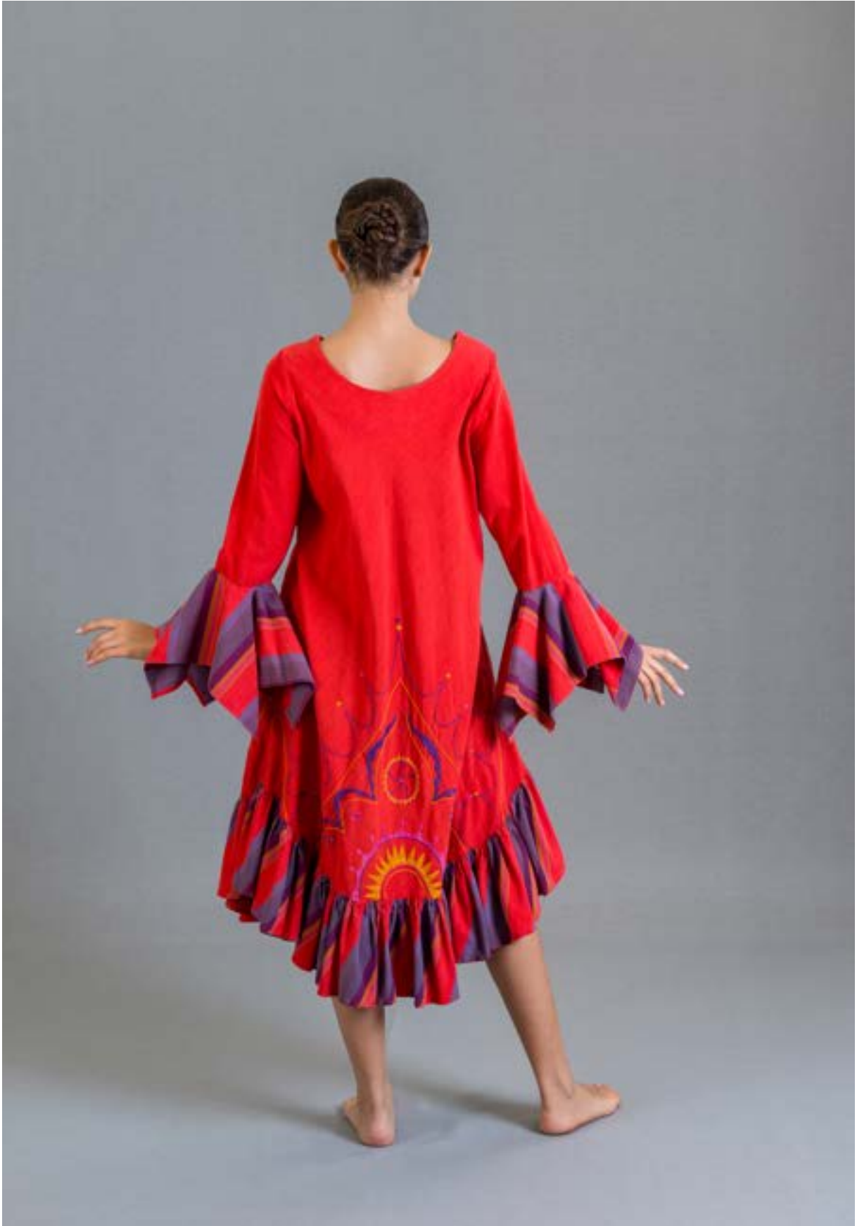
27. "Playa Azul" design by Josefa Ibarra, detail back view