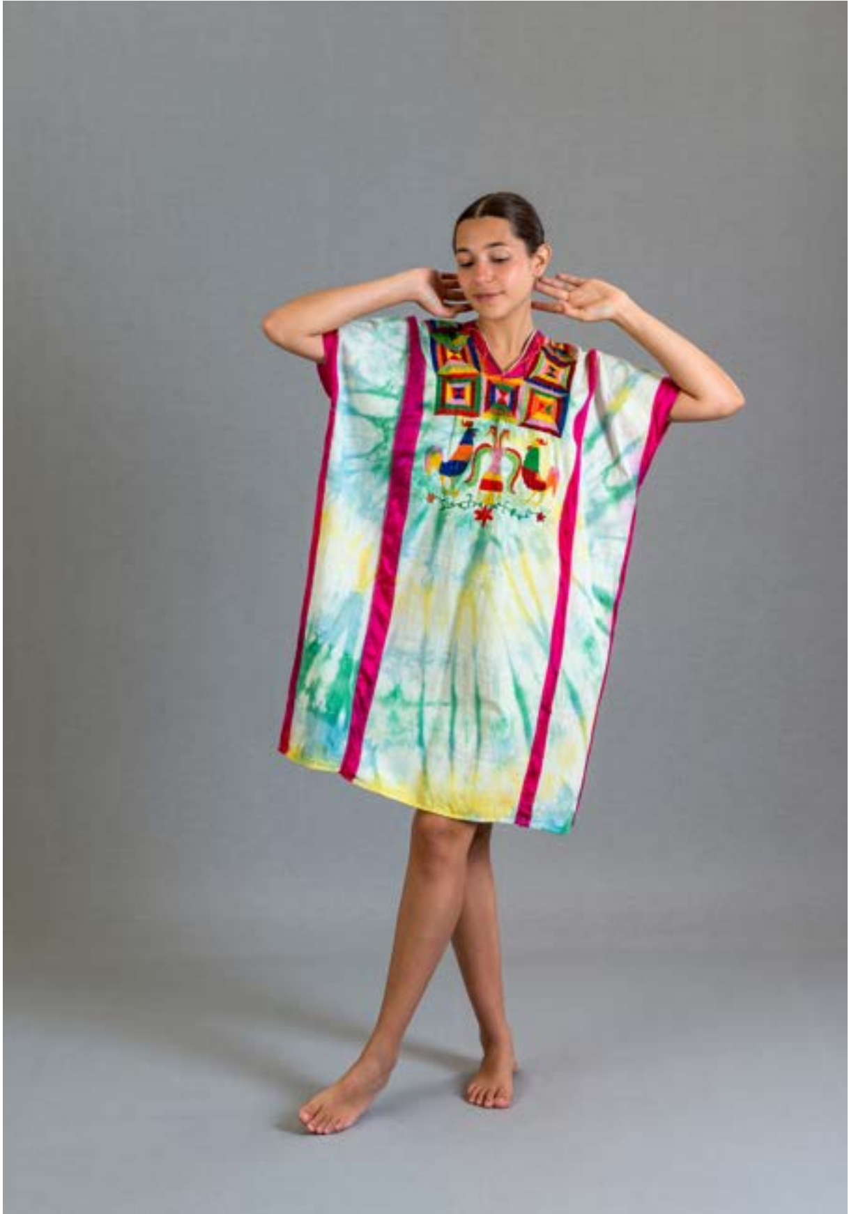
98. Design by Lirio's, c. 1970 Cotton manta, satin ribbon, hand embroidery, tie-dyed