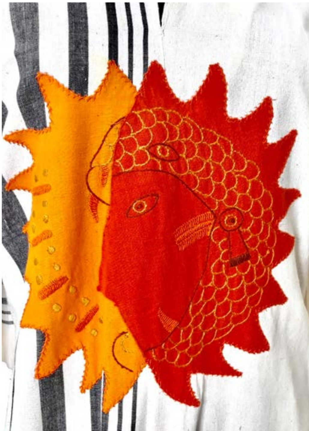
45. Design by Yolanda, detail appliqué and hand embroidery