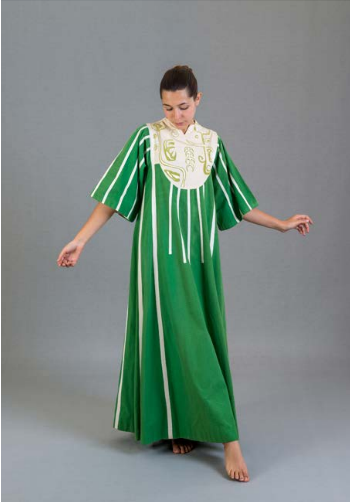
9. Vercellino Designs, c. 1965 Cotton manta, appliqué, hand embroidery