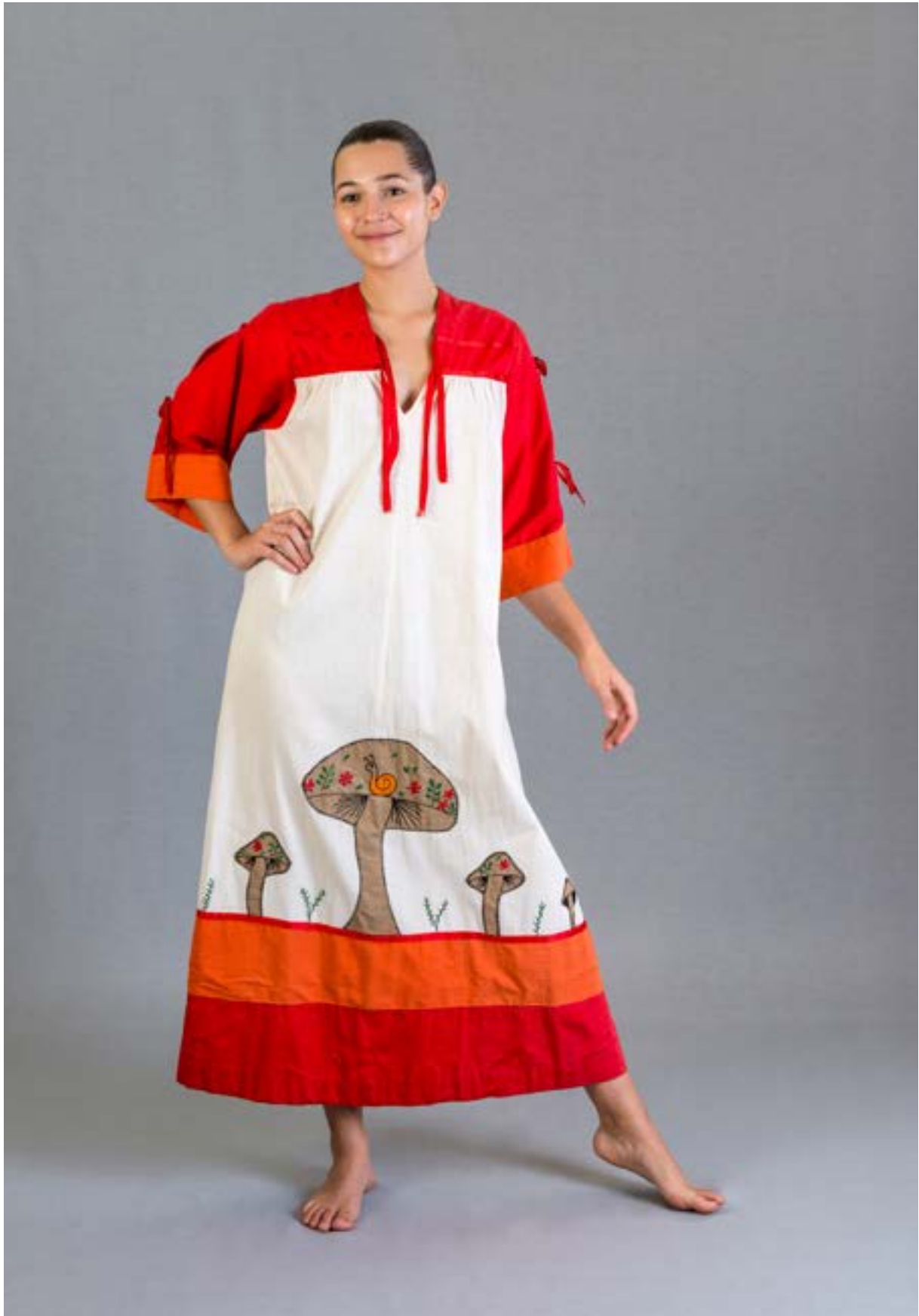
79. Design by Diseños Delfis, c. 1970 Cotton manta, satin ribbon, appliqué, hand embroidery