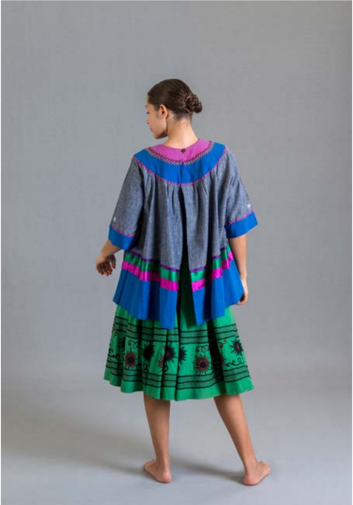
88. Top design by Irene Pulos and skirt design by Tachi Catillo, detail back view