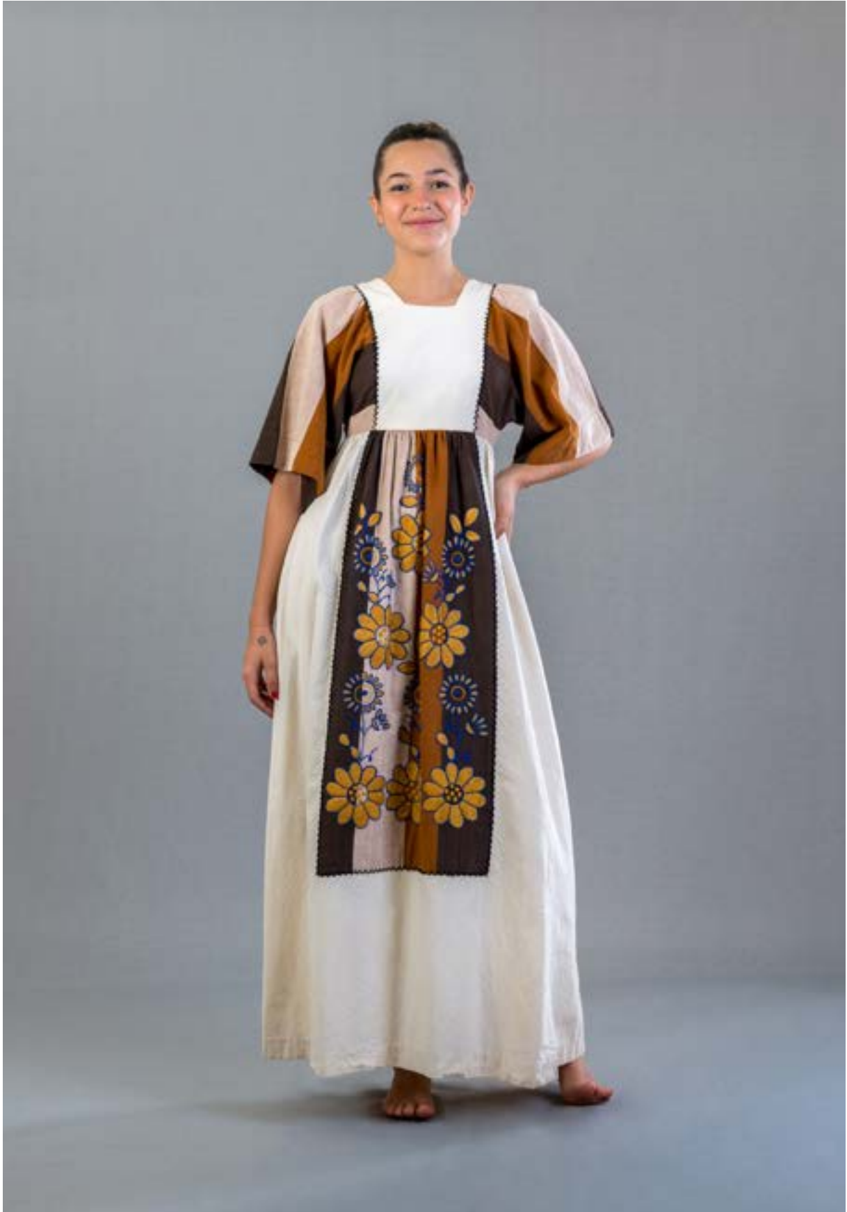
77. Design by Telas Tlaquepaque, c. 1967 Cotton manta, appliqué, hand embroidery