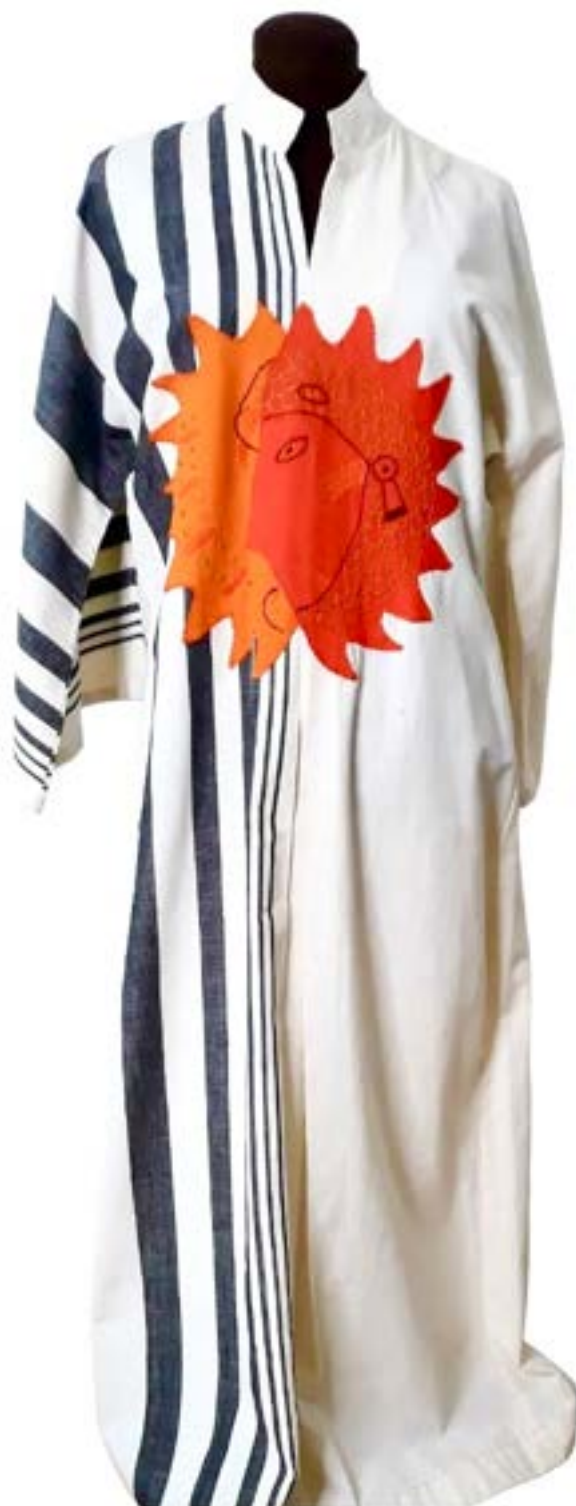
45. Design by Yolanda, c. 1970 Cotton manta, appliqué, hand embroidery