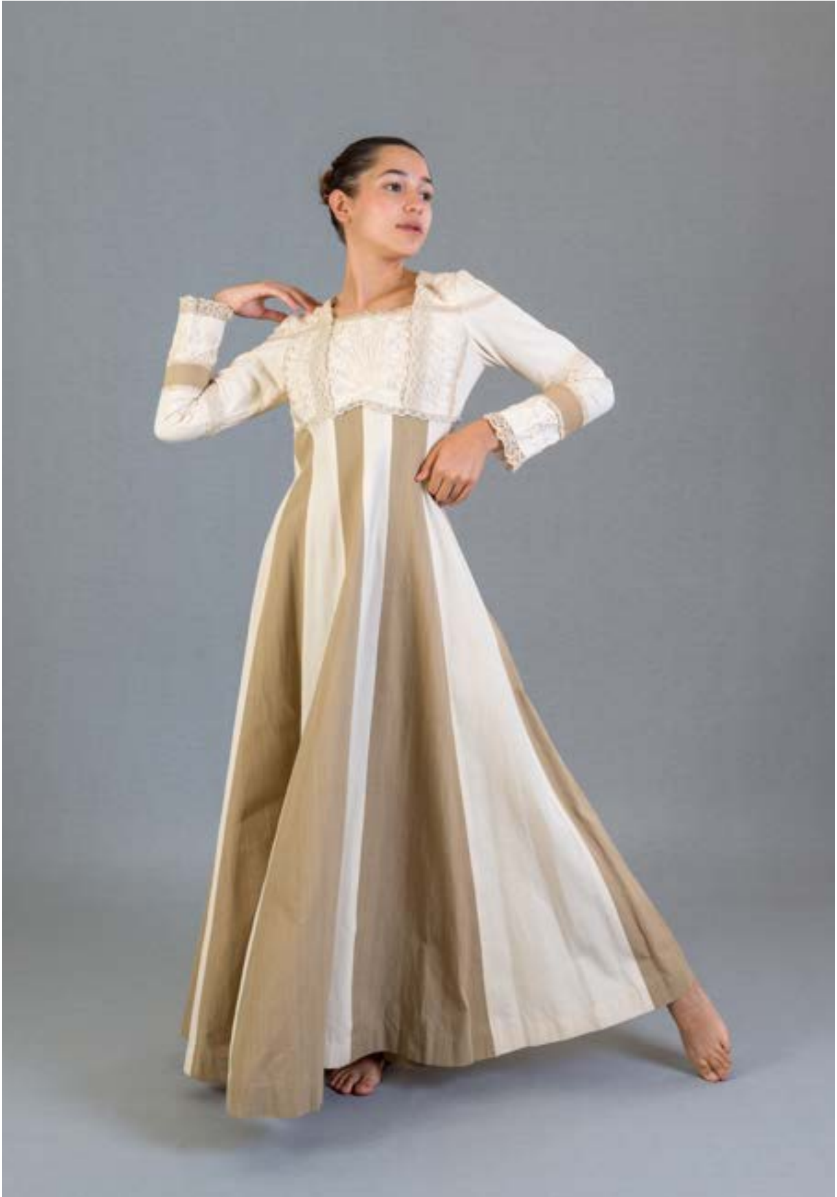
56. "T 22 L" design by Gonzalo Bauer for Girasol, c. 1969 Cotton manta, lace ribbon, soutache