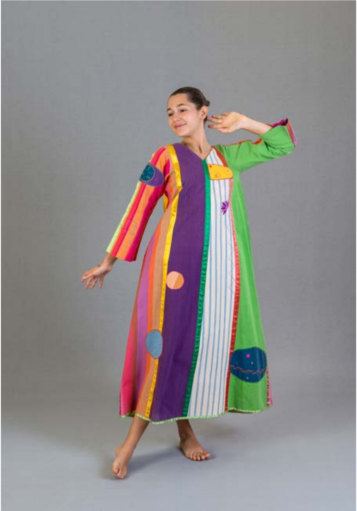
16. "Collage" design by Josefa Ibarra, c. 1970 Cotton manta, satin ribbon, appliqué, hand embroidery