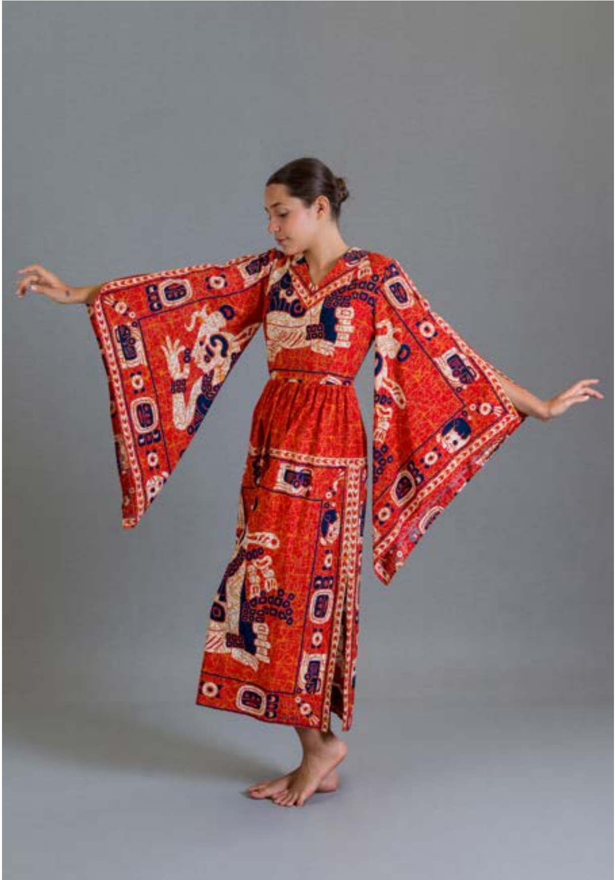
71. Design by Telas Escalera, c. 1968 Cotton batik