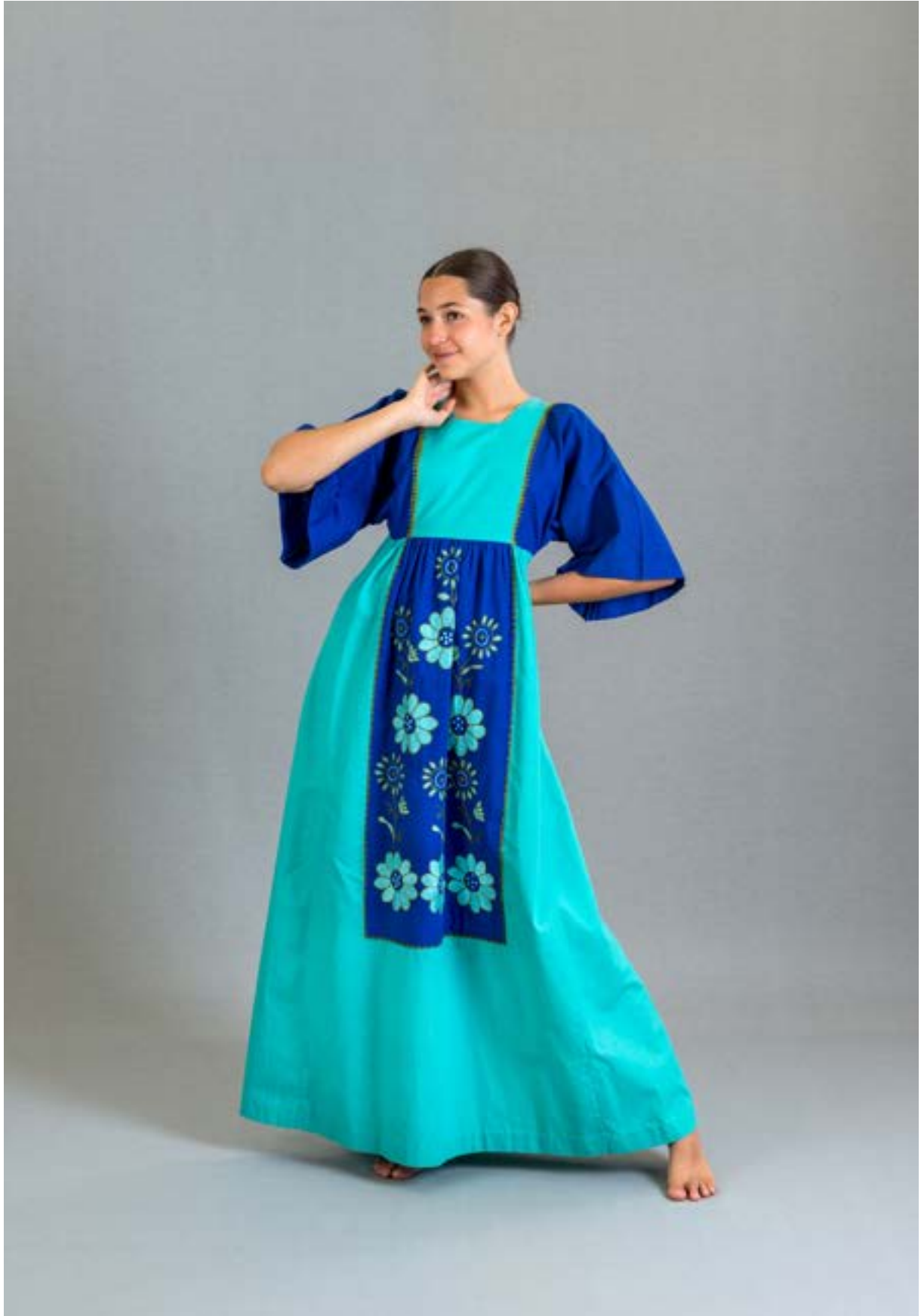
78. Design by Telas Tlaquepaque, c. 1967 Cotton manta, appliqué, hand embroidery