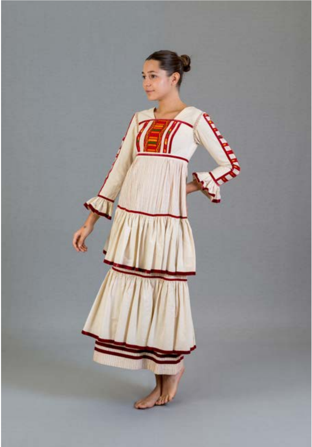
65. Design by Georgia Charuhas, c. 1970 Cotton manta, satin ribbon, velvet ribbon, appliqué, hand embroidery