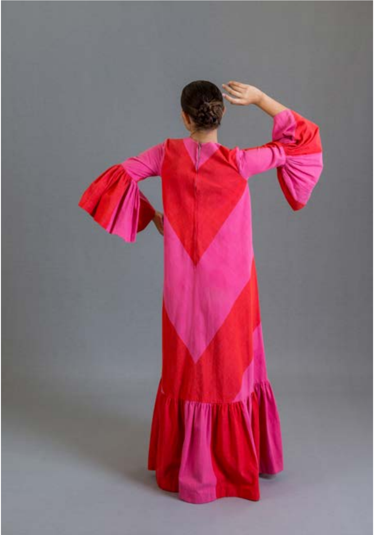
14. Design by Roberta Vercellino y Luis, detail back view