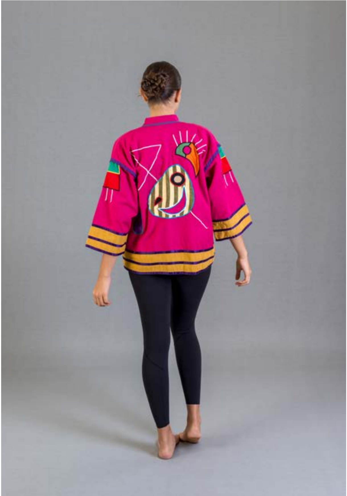
49. Design by Victor Camarena, c. 1975 (back view) Cotton manta, appliqué, hand embroidery