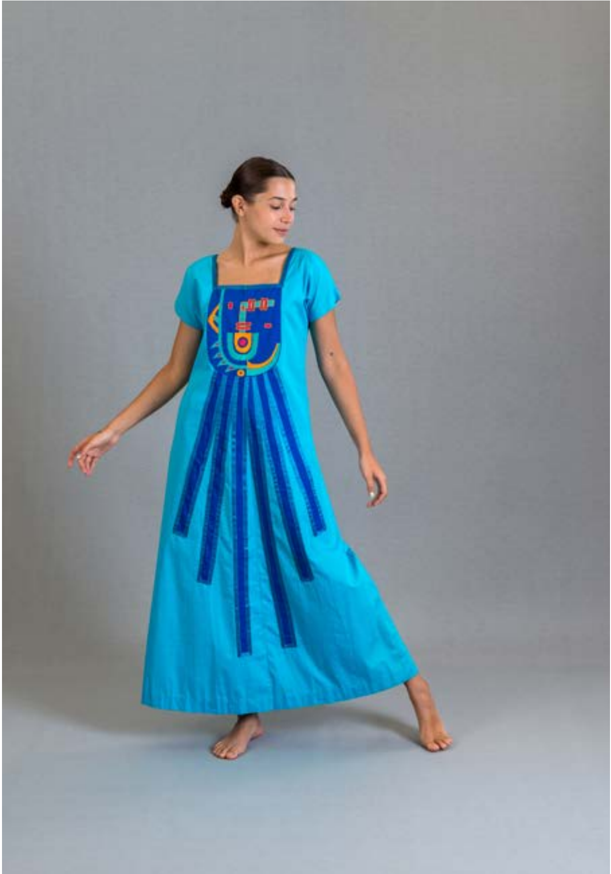
82. Design by Disenos Delfis Tlaquepaque, c. 1975 Cotton, satin ribbon, appliqué, hand embroidery