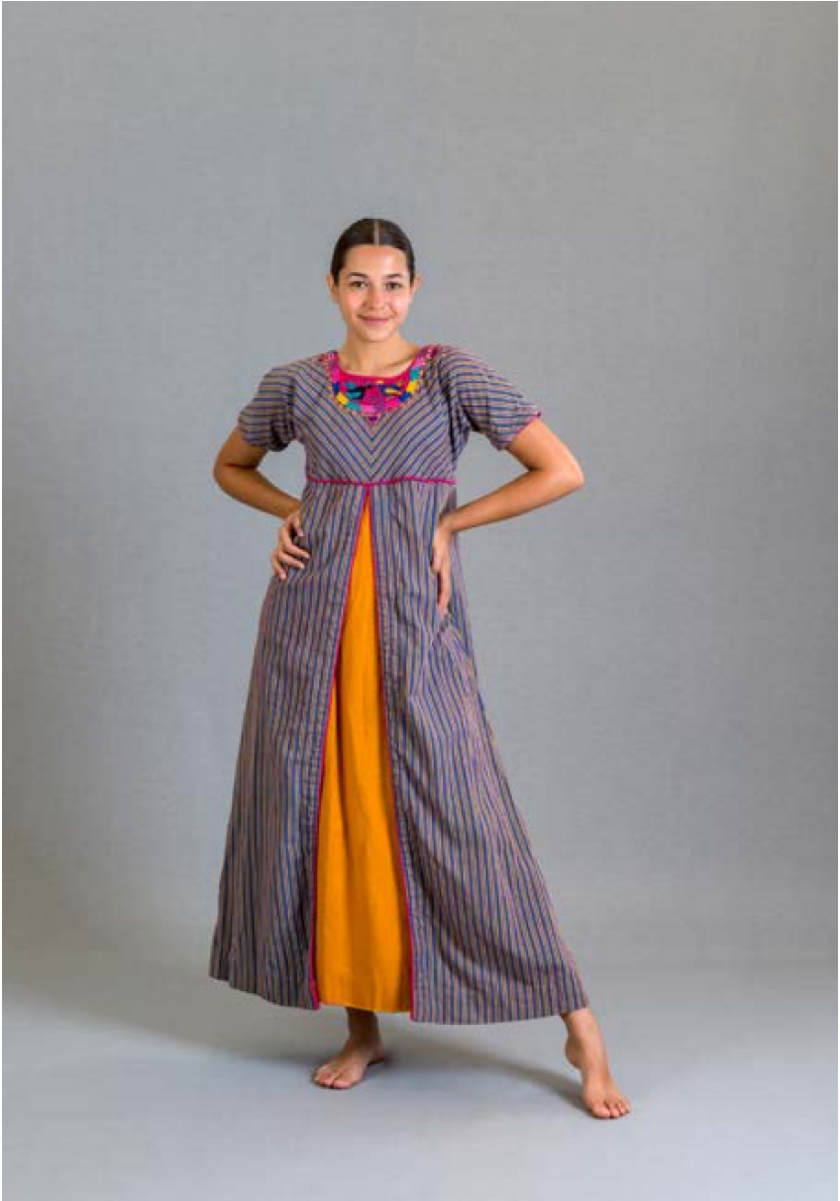
41. Design by Josefa Ibarra, c. 1965 Cotton manta, appliqué, hand embroidery