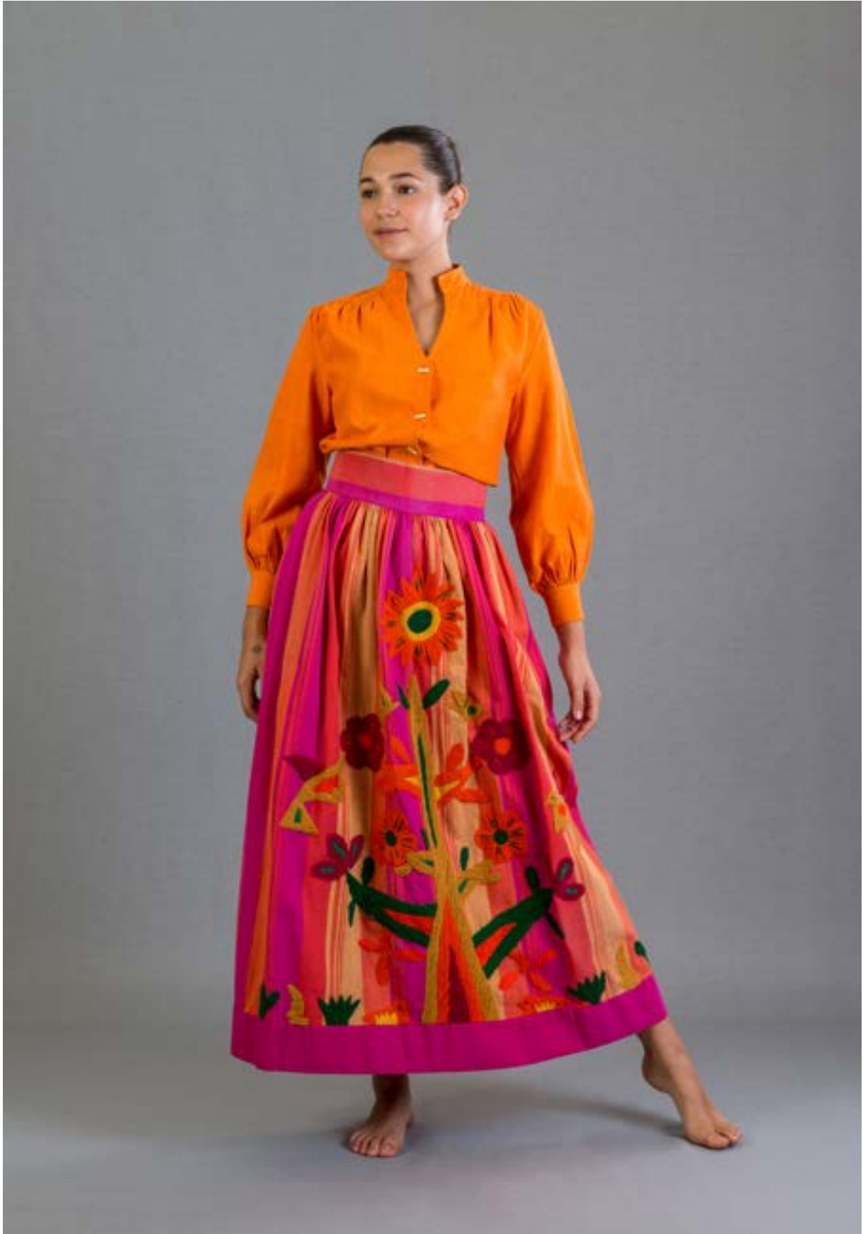
64. Top: Design by Gonzalo Bauer for Girasol, c. 1967 Cotton manta Skirt: Design by Gonzalo Bauer for Girasol, c. 1967 Cotton manta, appliqué, hand embroidery