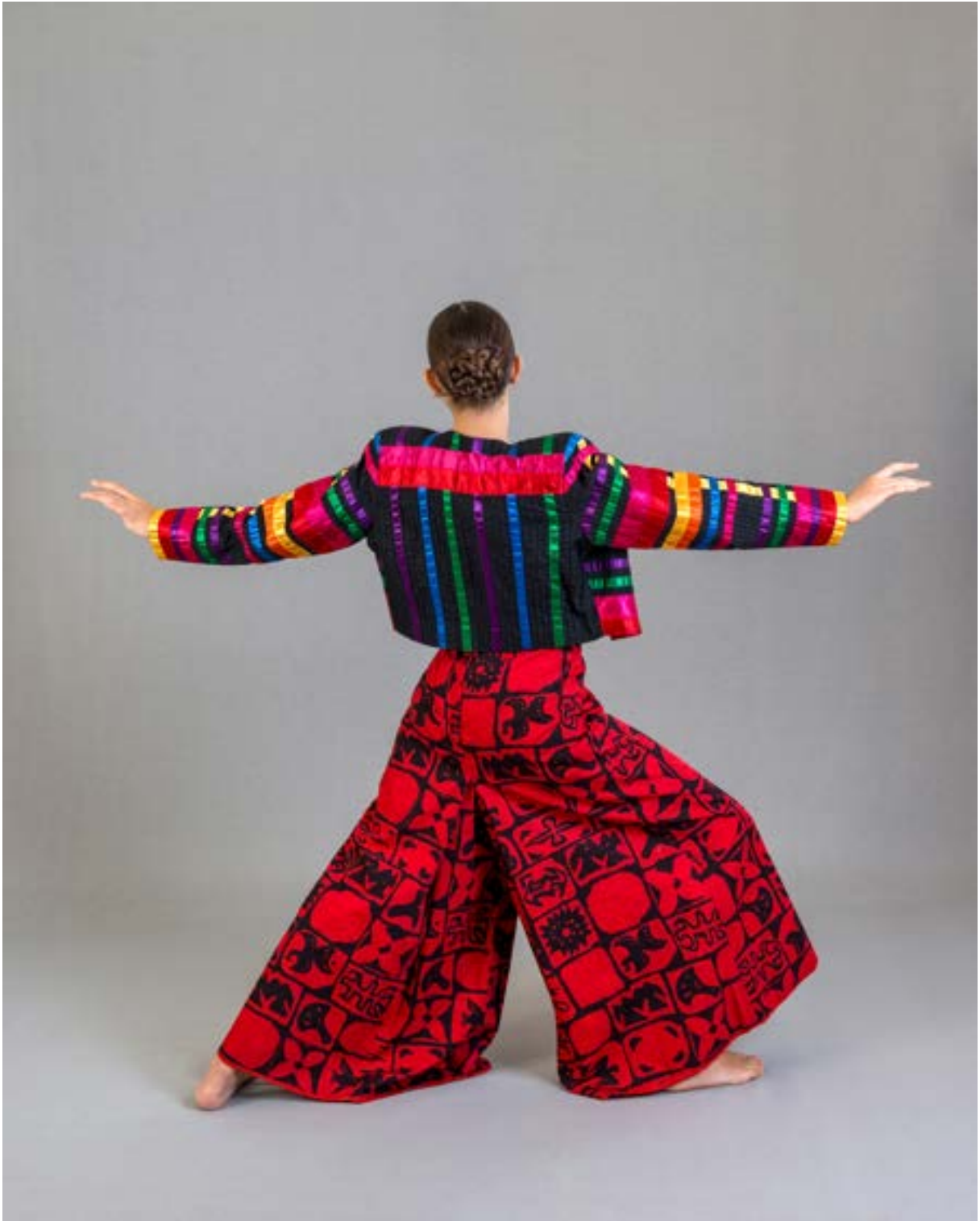
92. Top: Design by Tachi Castillo, c. 1975 (back view) Cotton, satin ribbon Pants: Design by Kristian, c. 1976 Cotton batik