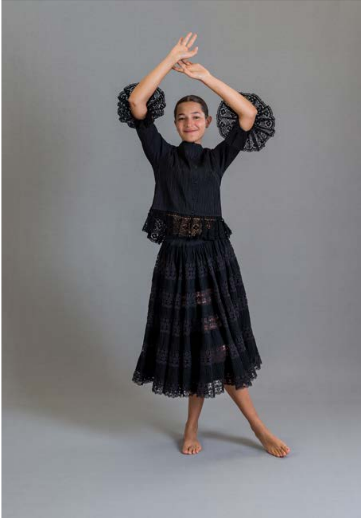
91. Design by Tachi Castillo, c. 1970 Cotton manta, cotton lace