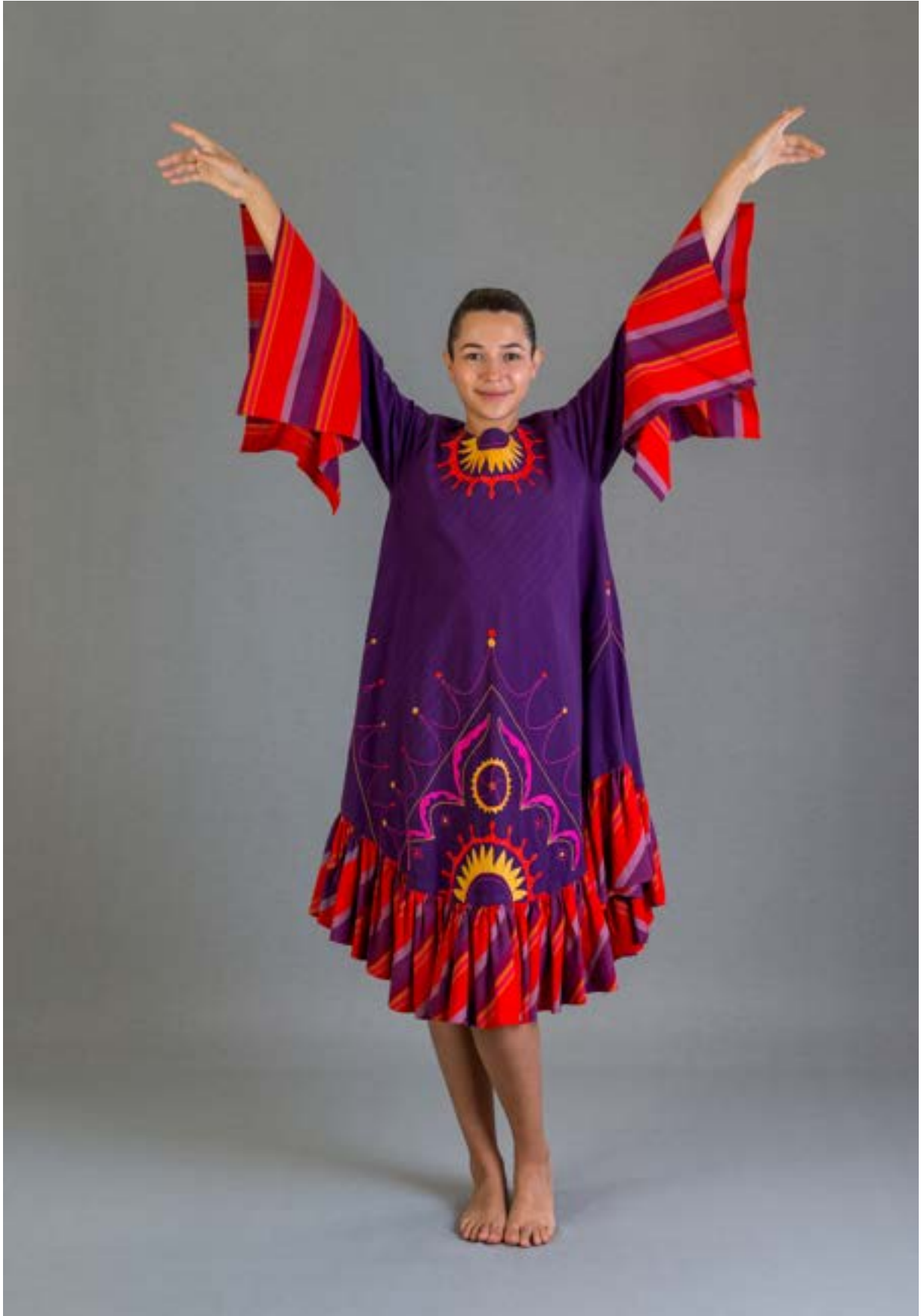
27. "Playa Azul" design by Josefa Ibarra, c. 1968 Cotton manta, appliqué, hand embroidery