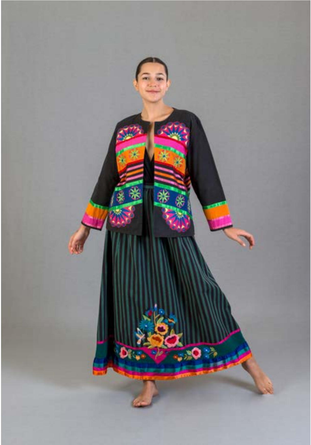
83. Top: Design by Diseños Delfis, c. 1970 Cotton manta, satin ribbon, appliqué, hand embroidery Skirt: Design by Gonzalo Bauer for Girasol, c. 1965 Cotton manta, satin ribbon, appliqué, hand embroidery