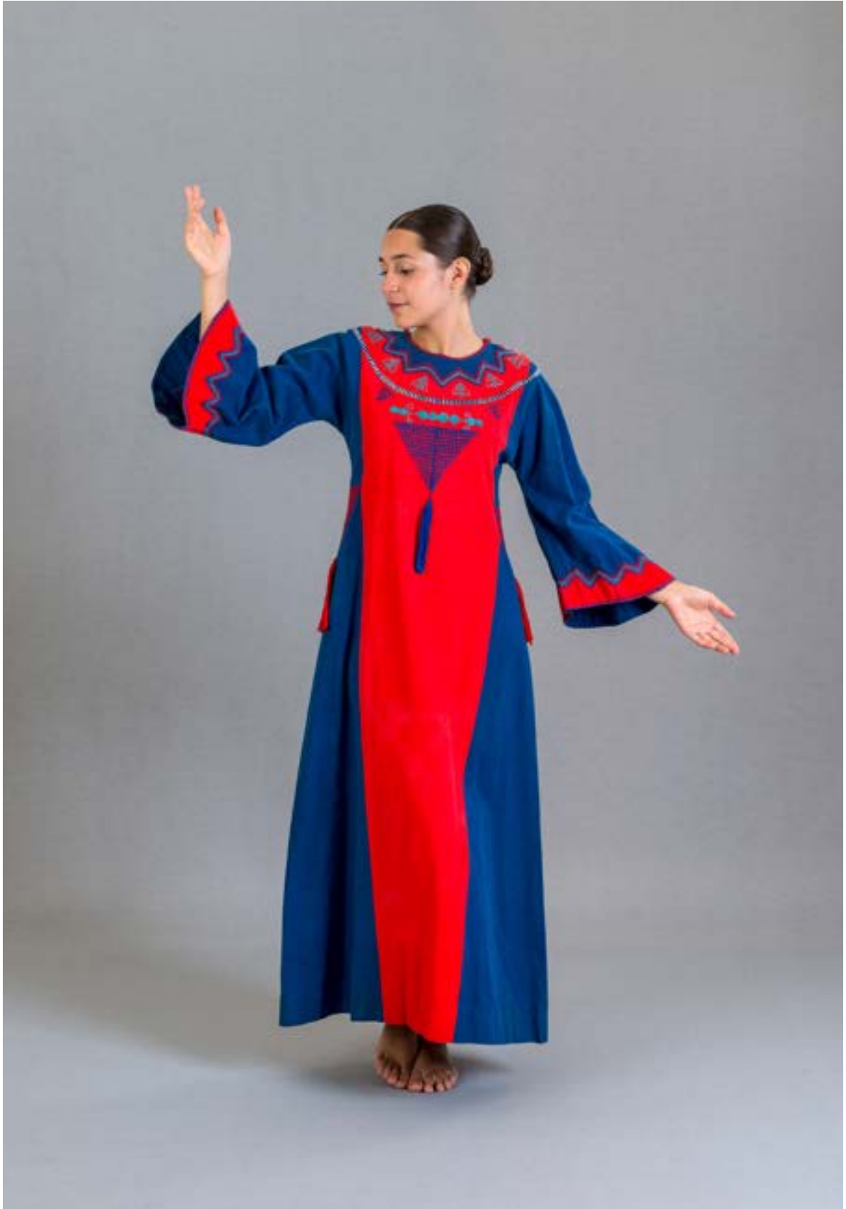
36. Design by Josefa Ibarra, c. 1970 Cotton manta, appliqué, hand embroidery