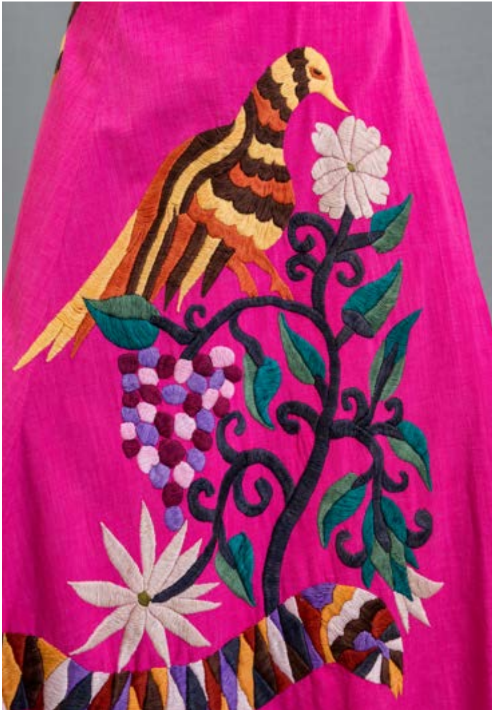
58. Skirt design by Gonzalo Bauer for Girasol, detail hand embroidery