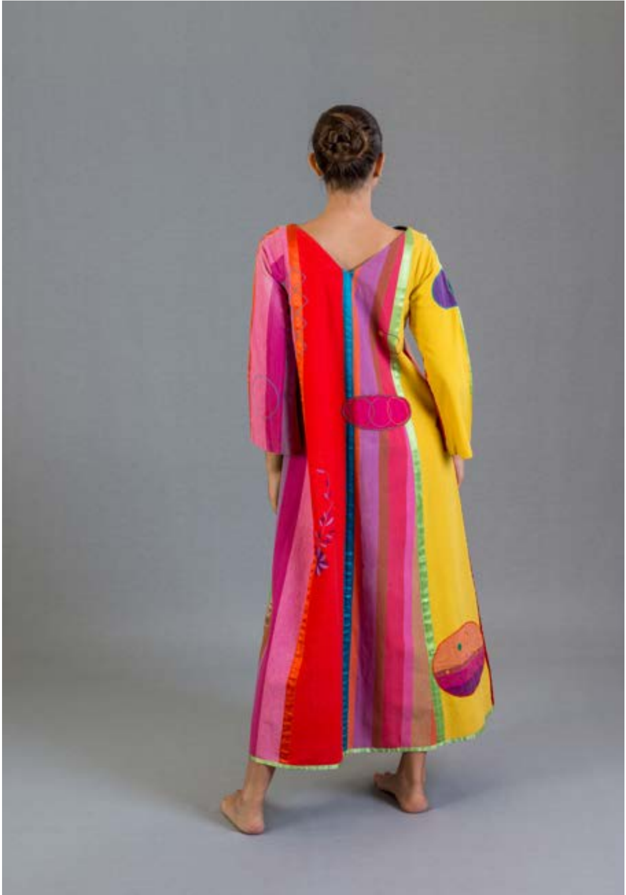
16. "Collage" design by Josefa Ibarra, detail back view