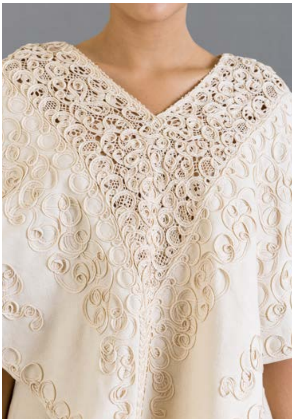
97. Ensemble by unknown designer, detail soutache appliqué