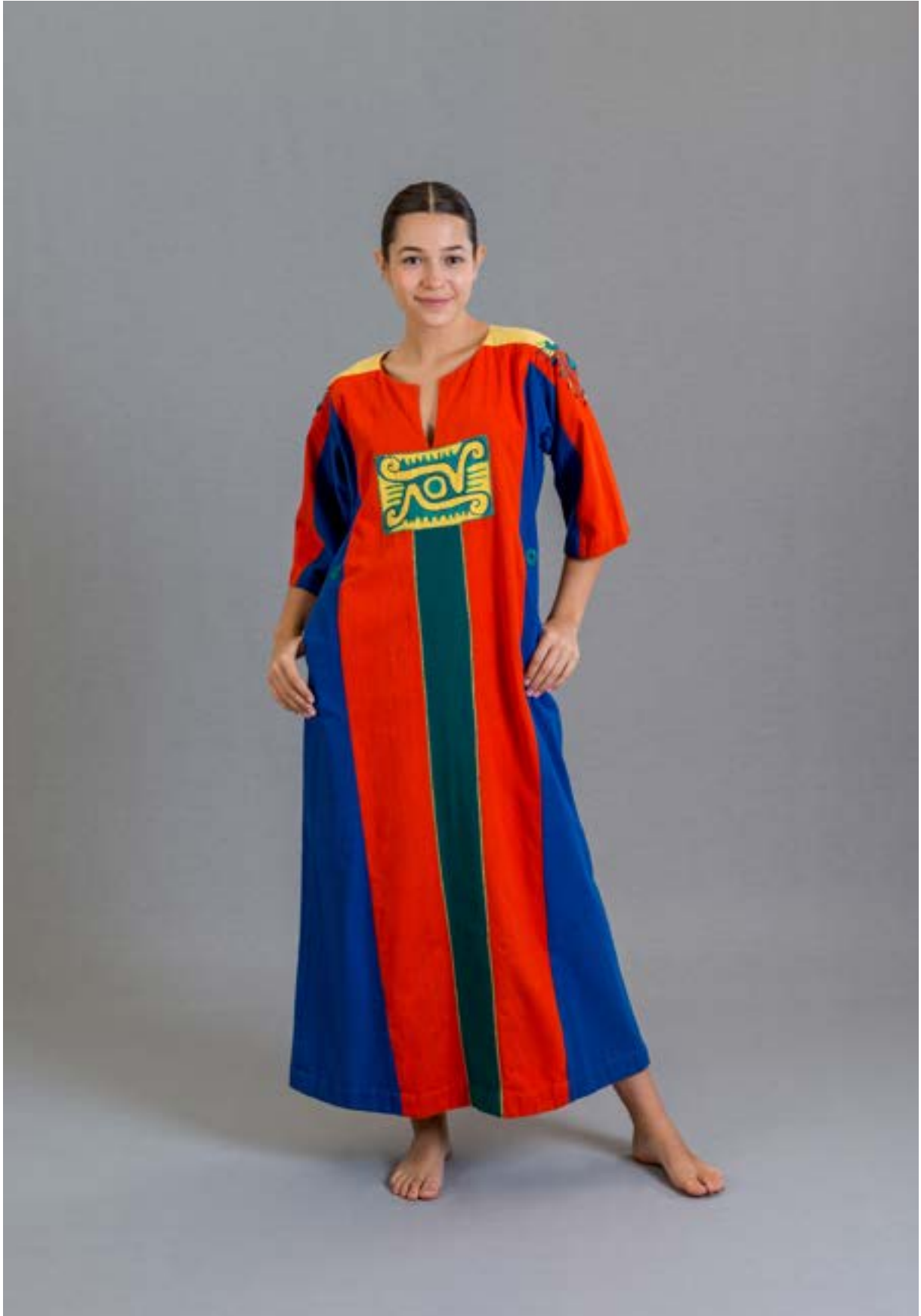
34. Design by Josefa Ibarra, c. 1970 Cotton manta, appliqué, hand embroidery