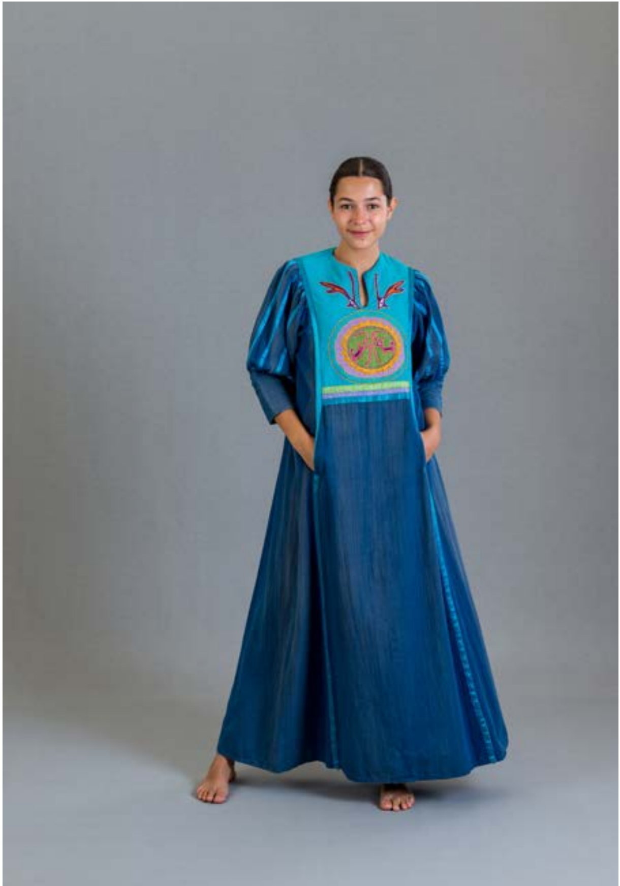
80. Design by Diseños Delfis, c. 1970 Cotton manta, appliqué, hand embroidery