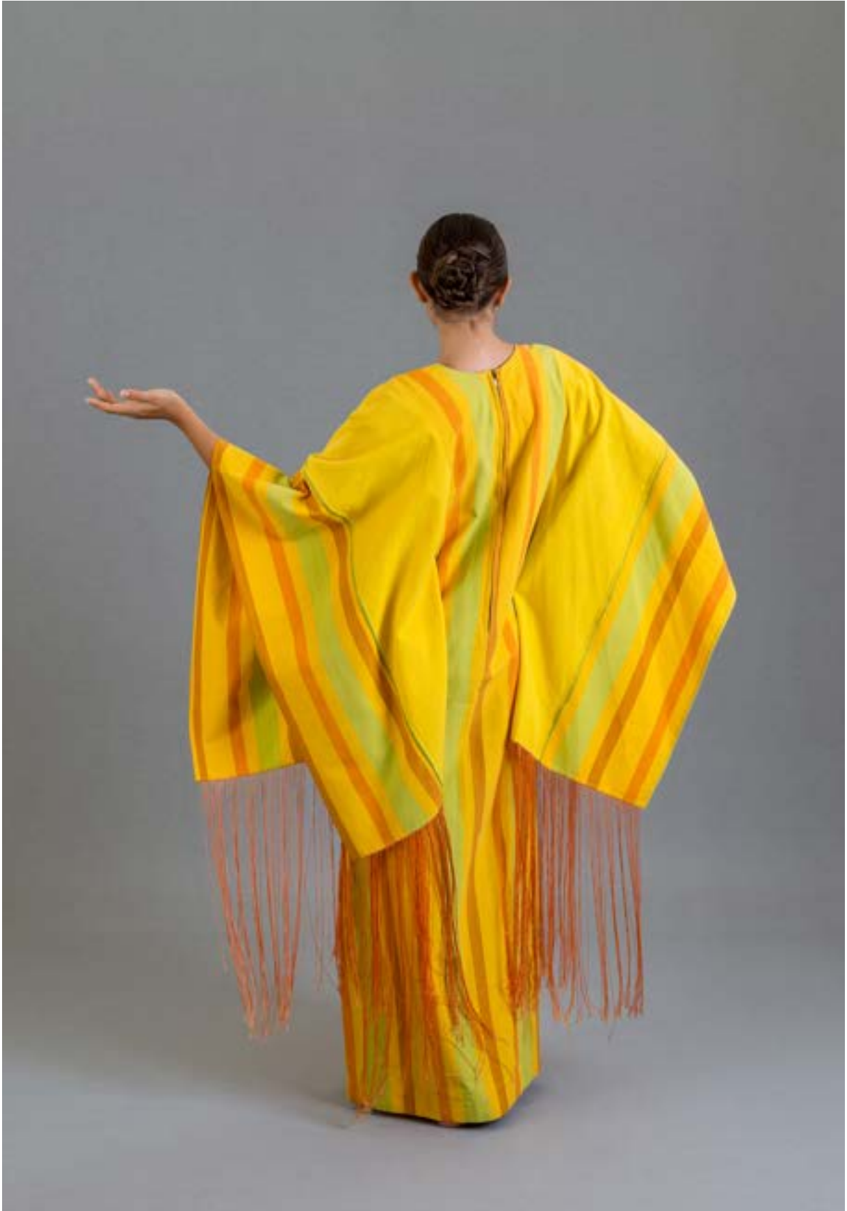
44. Design by Josefa Ibarra, detail back view