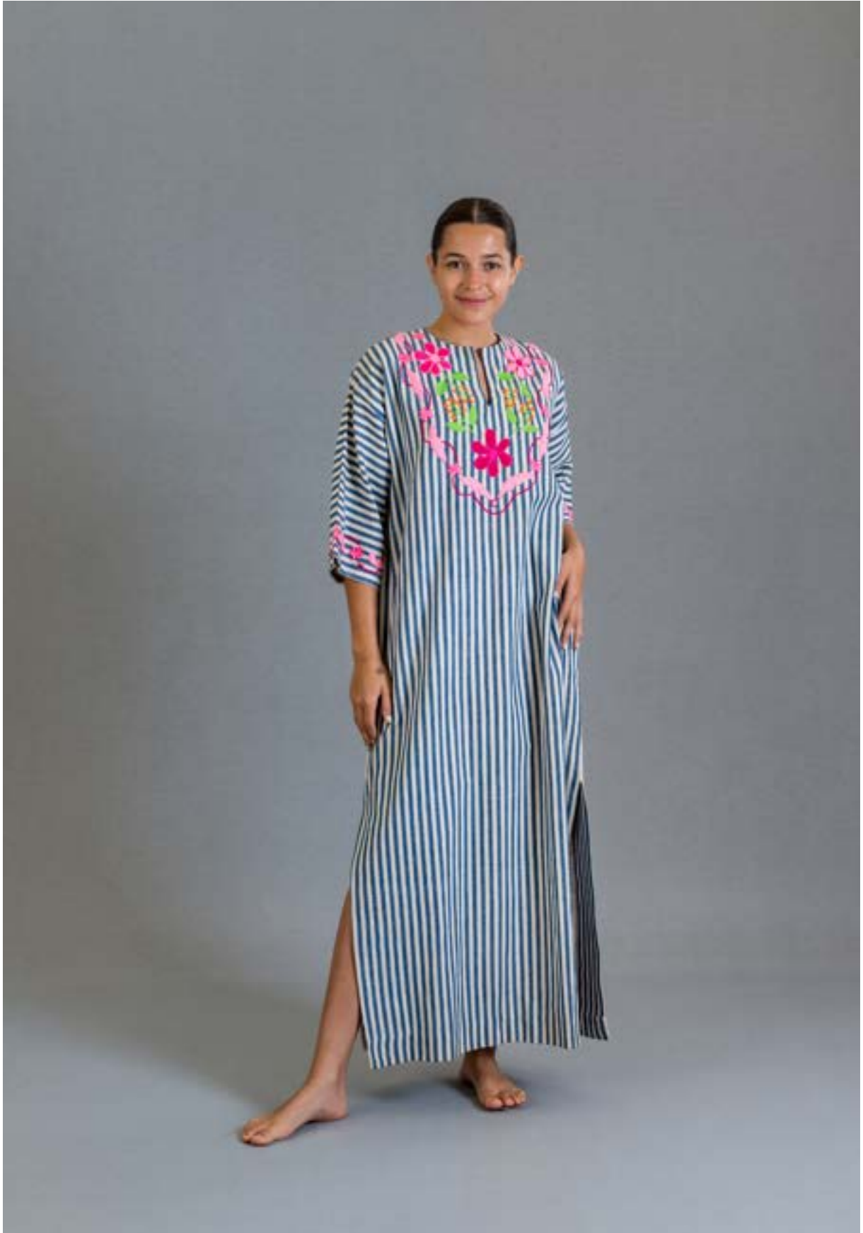
81. Design by Telas Tlaquepaque for Diseños Delfis, c. 1967 Cotton manta, hand embroidery