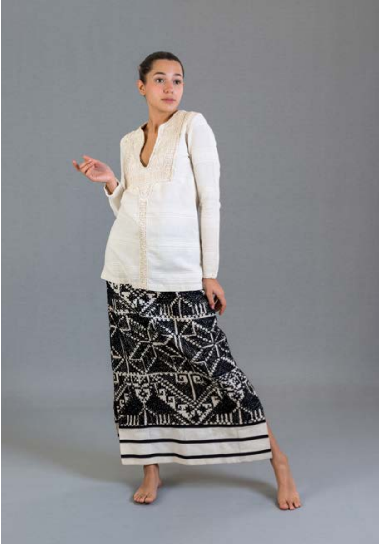
60. Top: Design by Gonzalo Bauer for Girasol, c. 1966 Cotton manta, soutache Skirt: Design by Gonzalo Bauer for Girasol, c. 1966 Cotton manta, wool embroidery