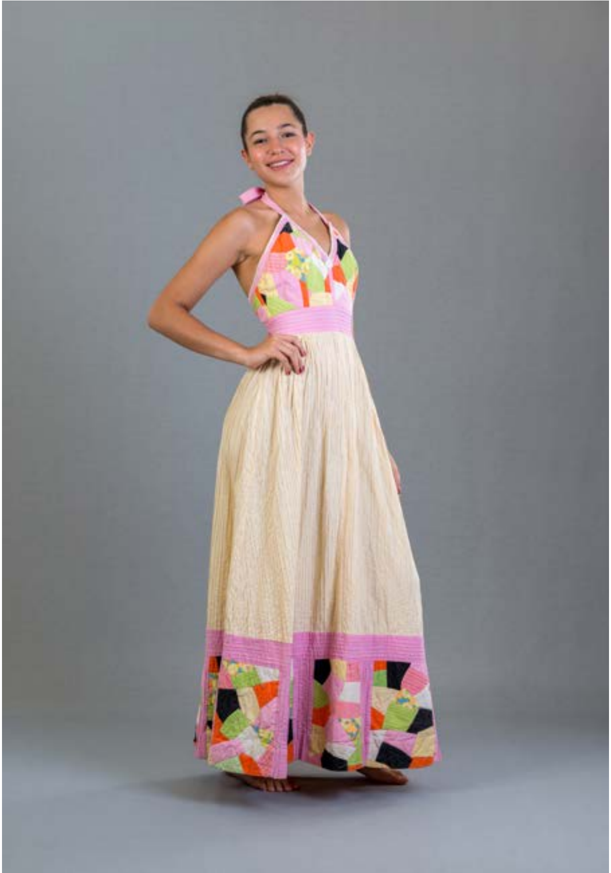
66. " Cinderella " design by Georgia Charuhas, c. 1970 Cotton manta, appliqué, lace, hand embroidery