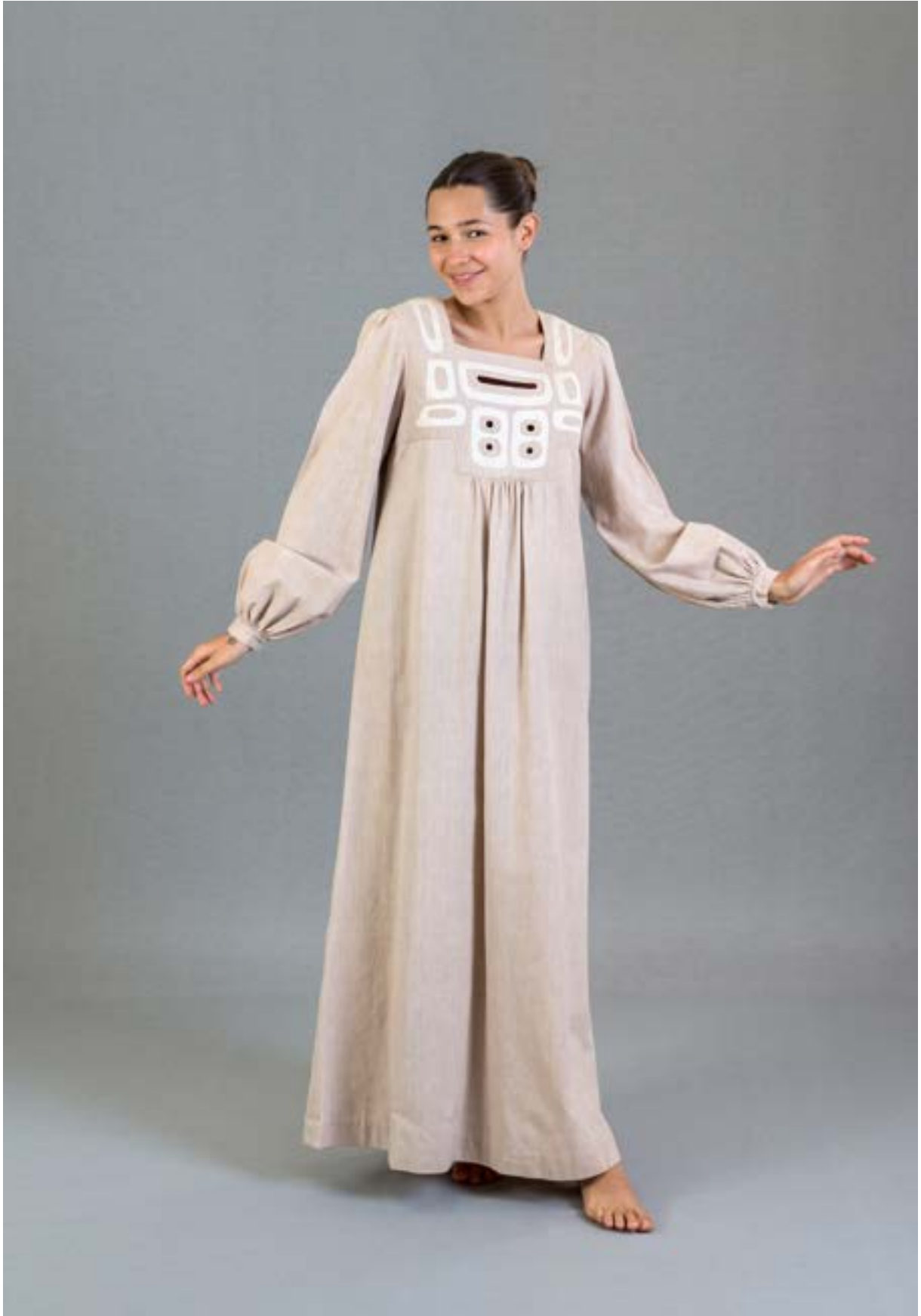
94. Design by Sergio Bustamante, c. 1970 Cotton manta, appliqué, hand embroidery