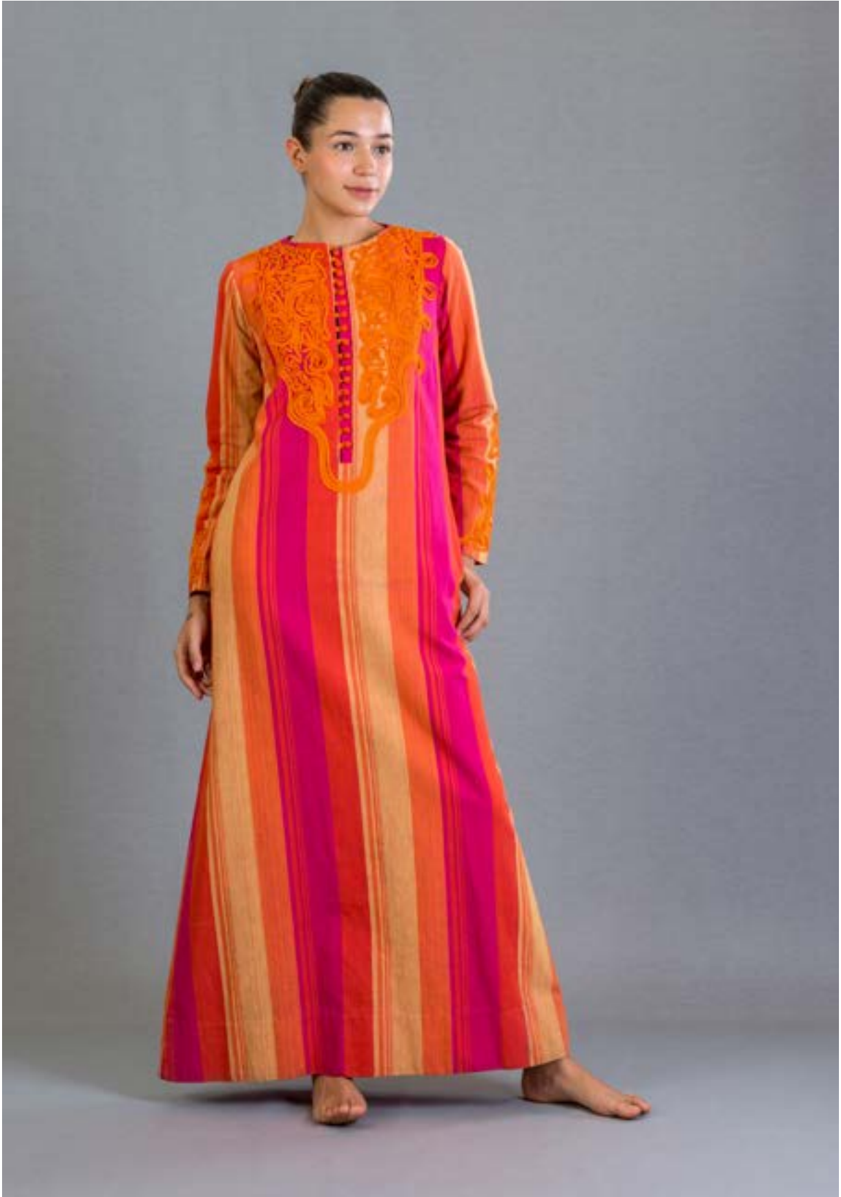
59. Design by Gonzalo Bauer for Girasol, c. 1970 Cotton manta, ribbon, soutache, buttons