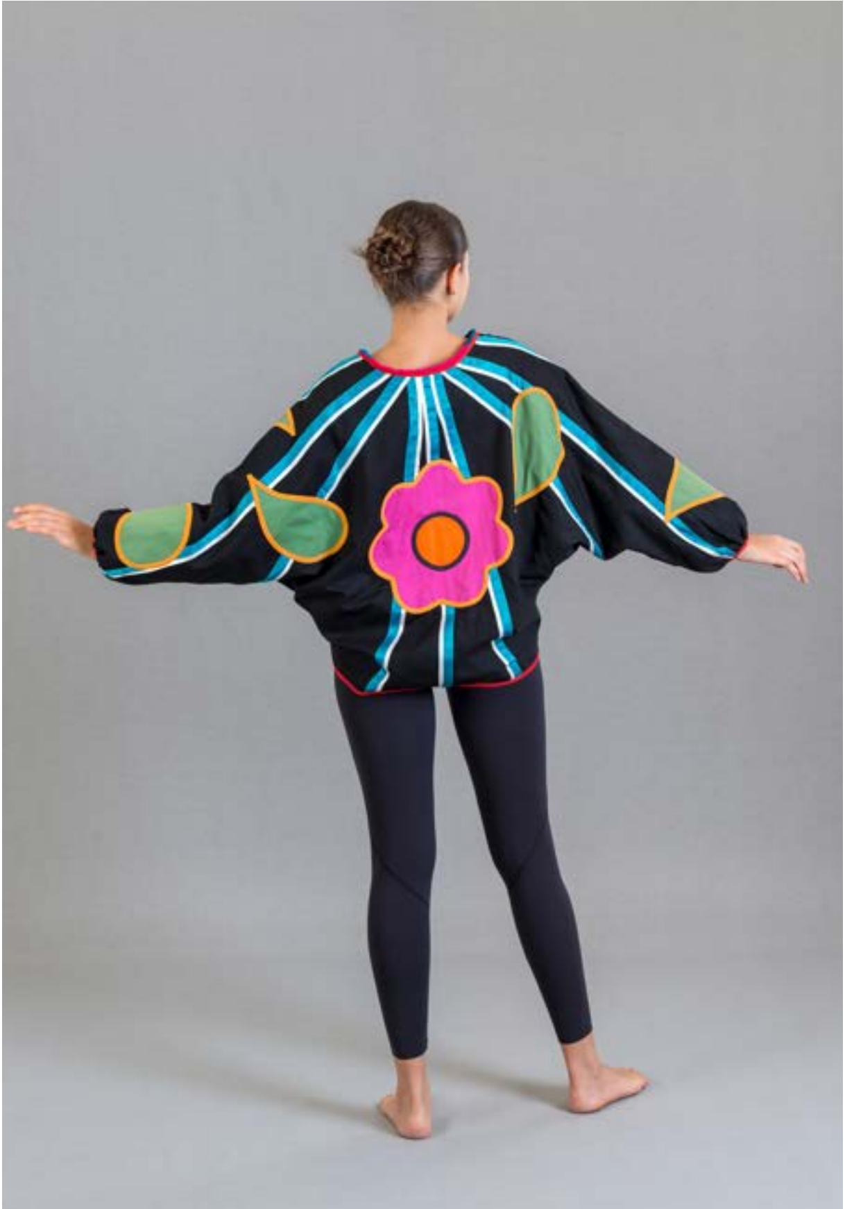
50. Design by Victor Camarena, c. 1968 (back view) Cotton manta, satin ribbon, appliqué, hand embroidery