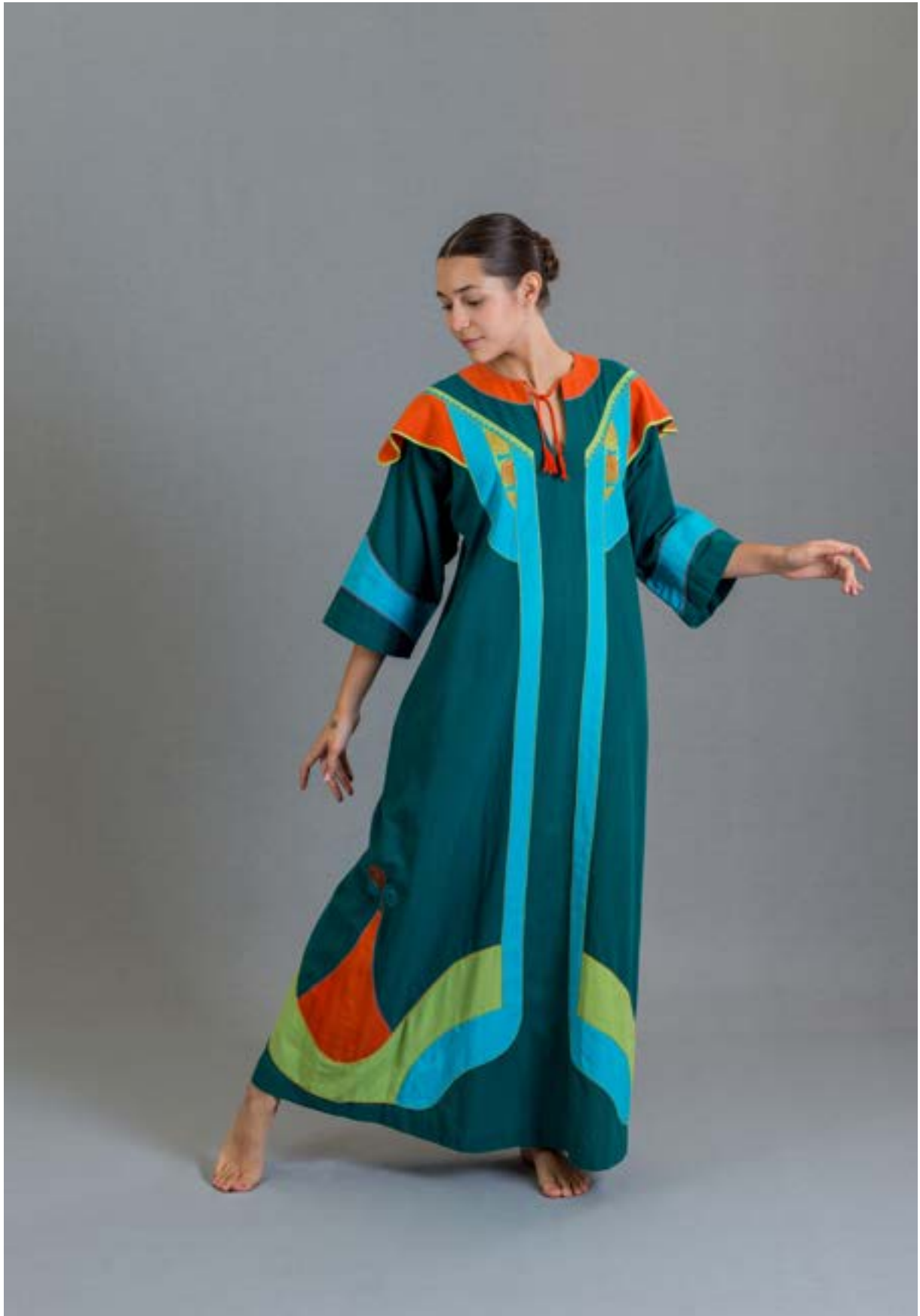
39. Design by Josefa Ibarra, c. 1975 Cotton manta, appliqué, hand embroidery