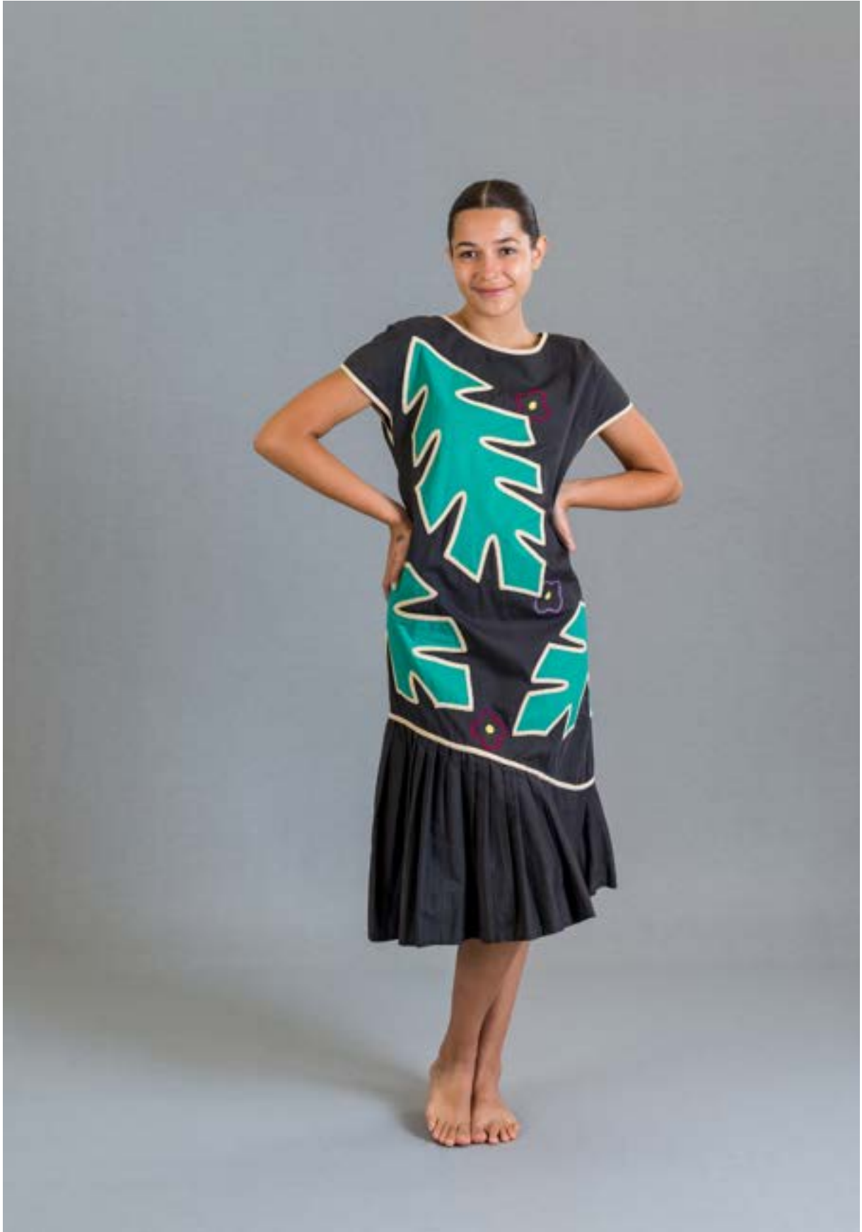
53. Design by Victor Camarena, c. 1978 Cotton manta, appliqué, hand embroidery