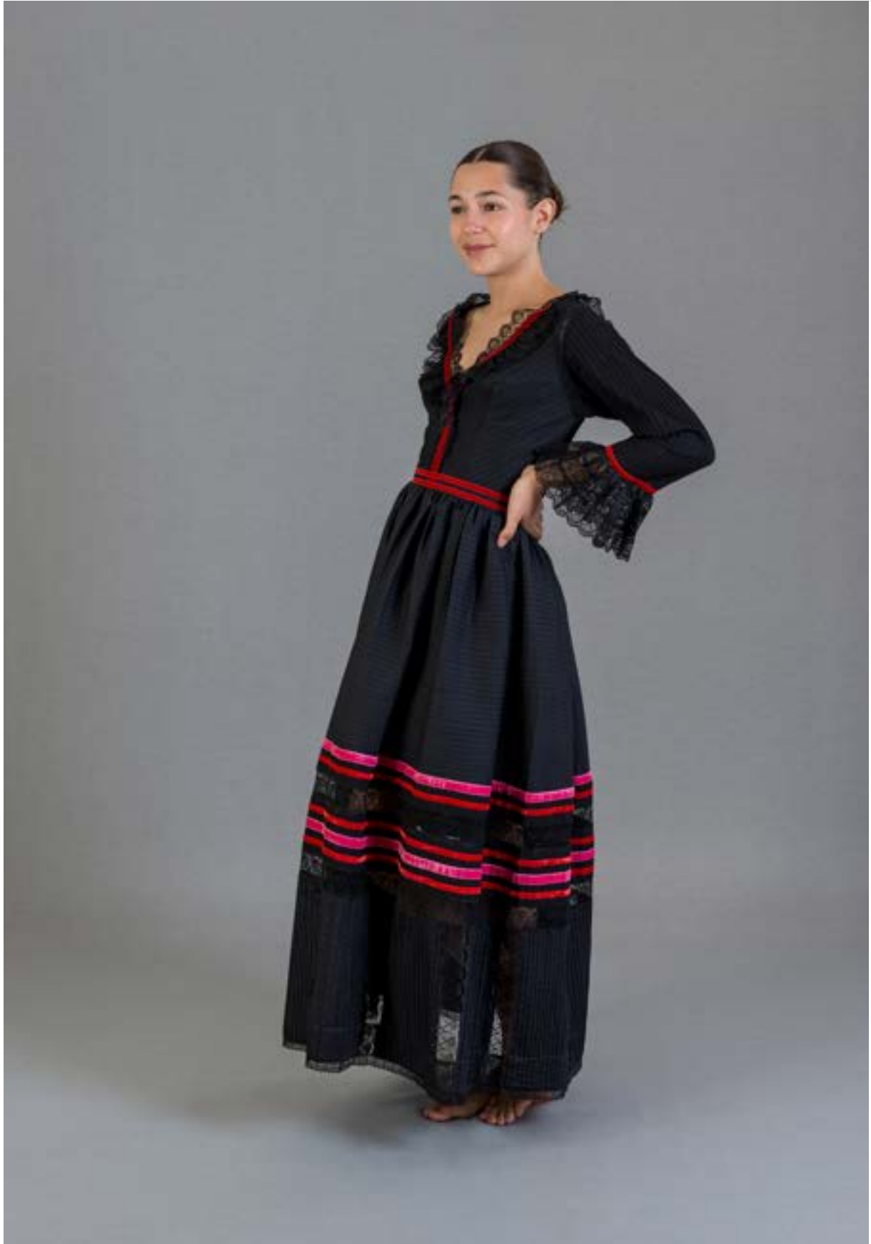
67. "Duquesa" design by Georgia Charuhas, c. 1970 Cotton manta, velvet ribbon, lace