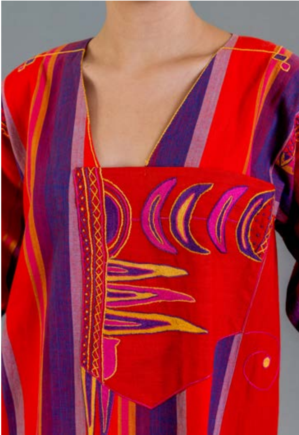
28. Design by Josefa Ibarra, detail hand embroidery