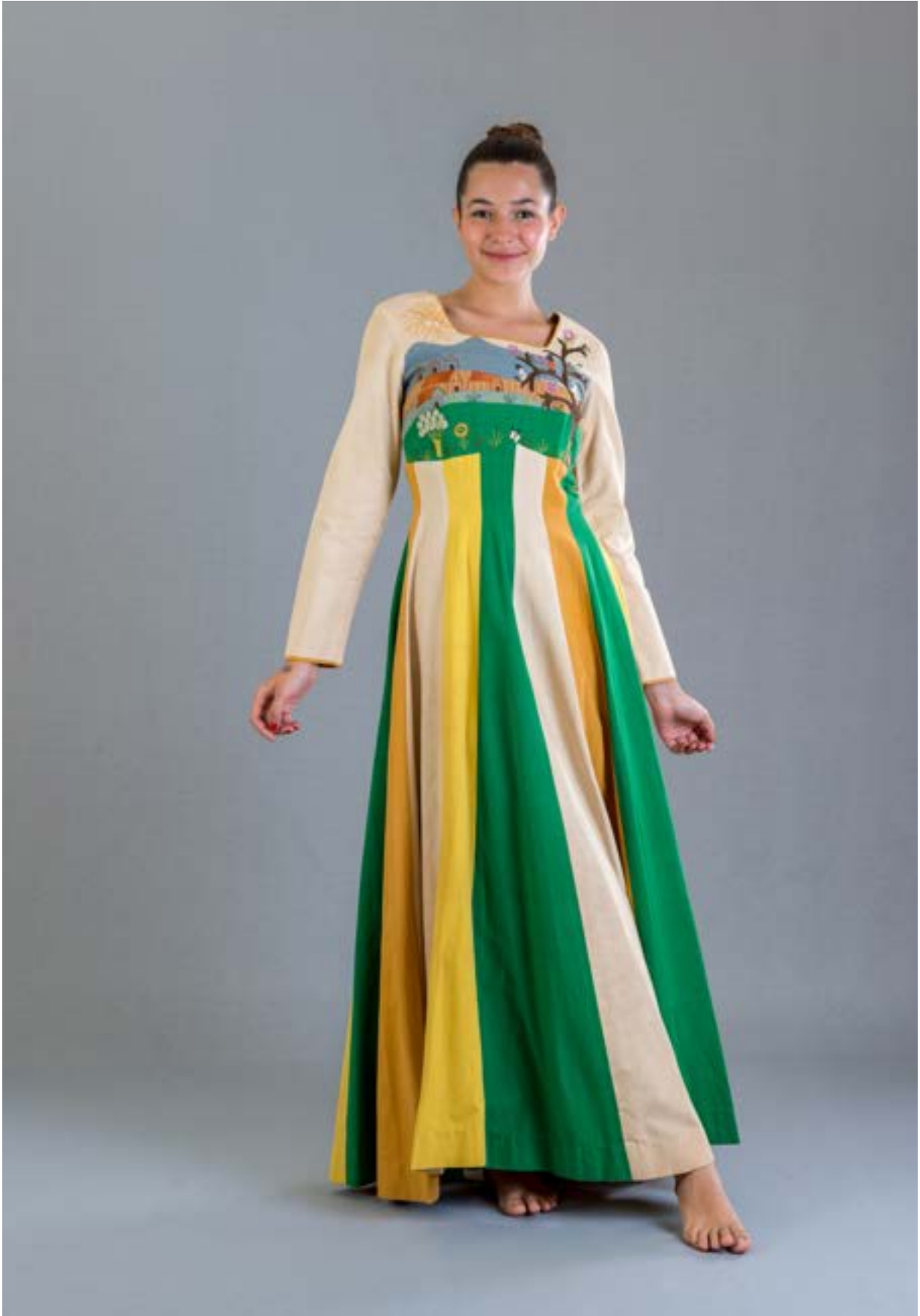
57. Design by Gonzalo Bauer for Girasol, c. 1969 Cotton manta, hand embroidery