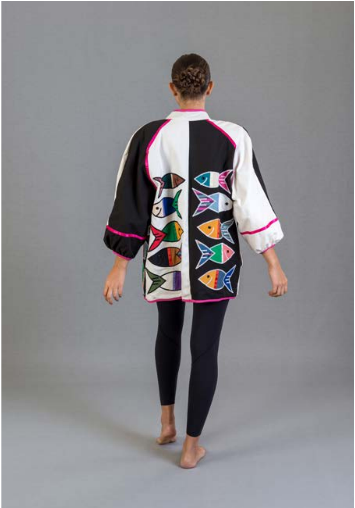
47. Design by Victor Camarena, c. 1975 (back view) Cotton manta, satin ribbon, appliqué, hand embroidery, wood beads