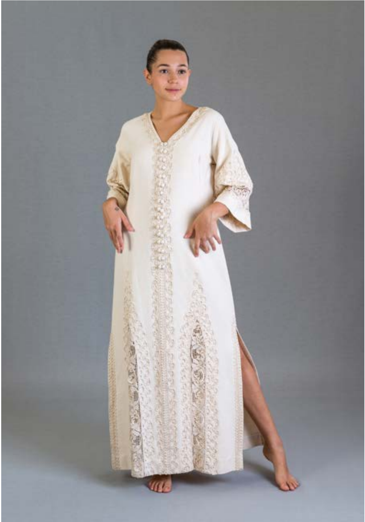
95. Design by Suzette International, c. 1965 Cotton manta, lace, ribbon, soutache