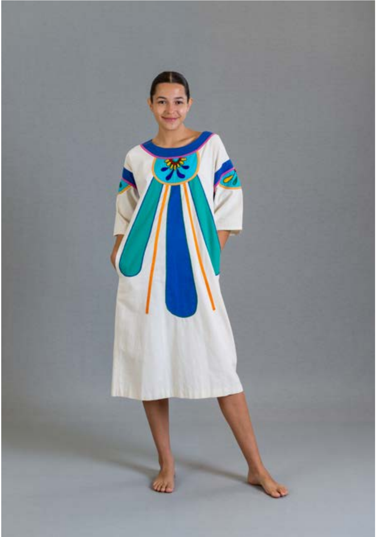
52. Design by Victor Camarena, c. 1970 Cotton manta, appliqué, hand embroidery