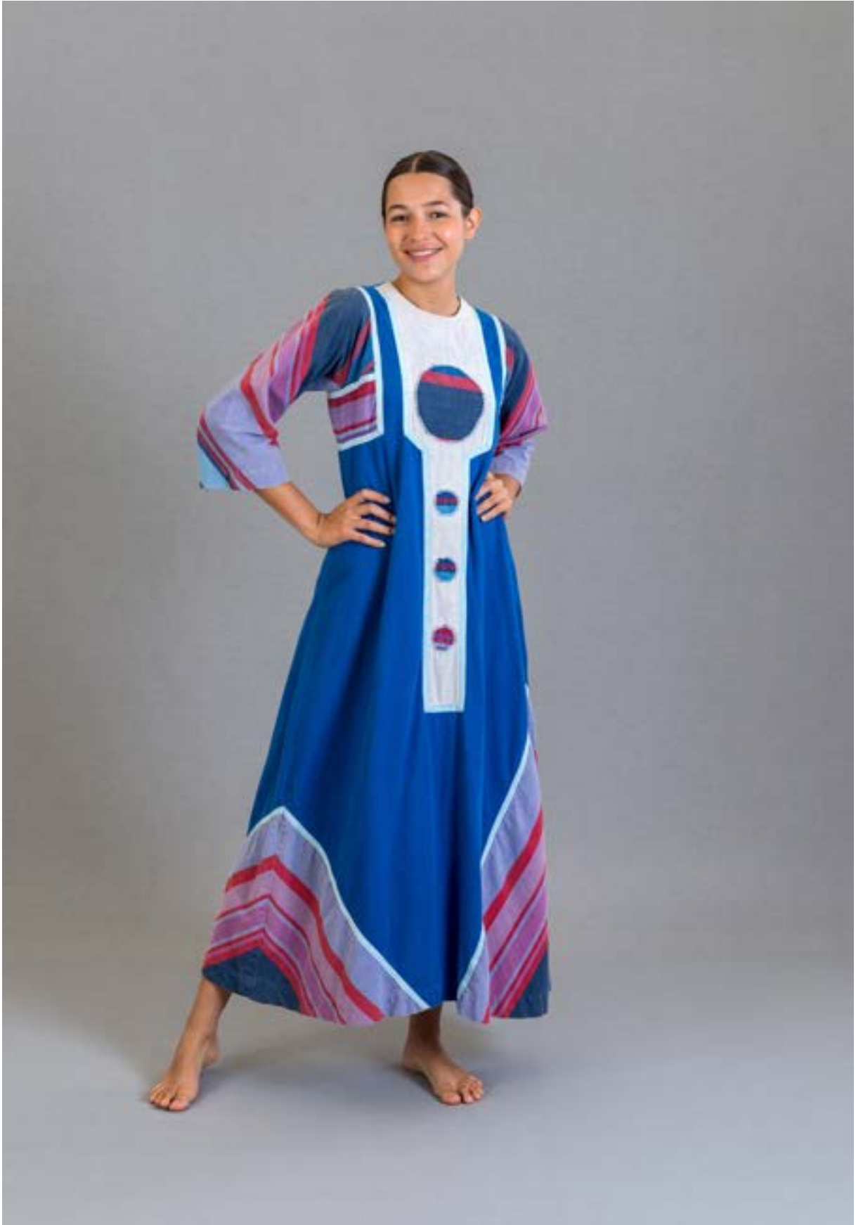
10. Vercellino Designs, c. 1968 Cotton manta, satin ribbon, appliqué, hand embroidery