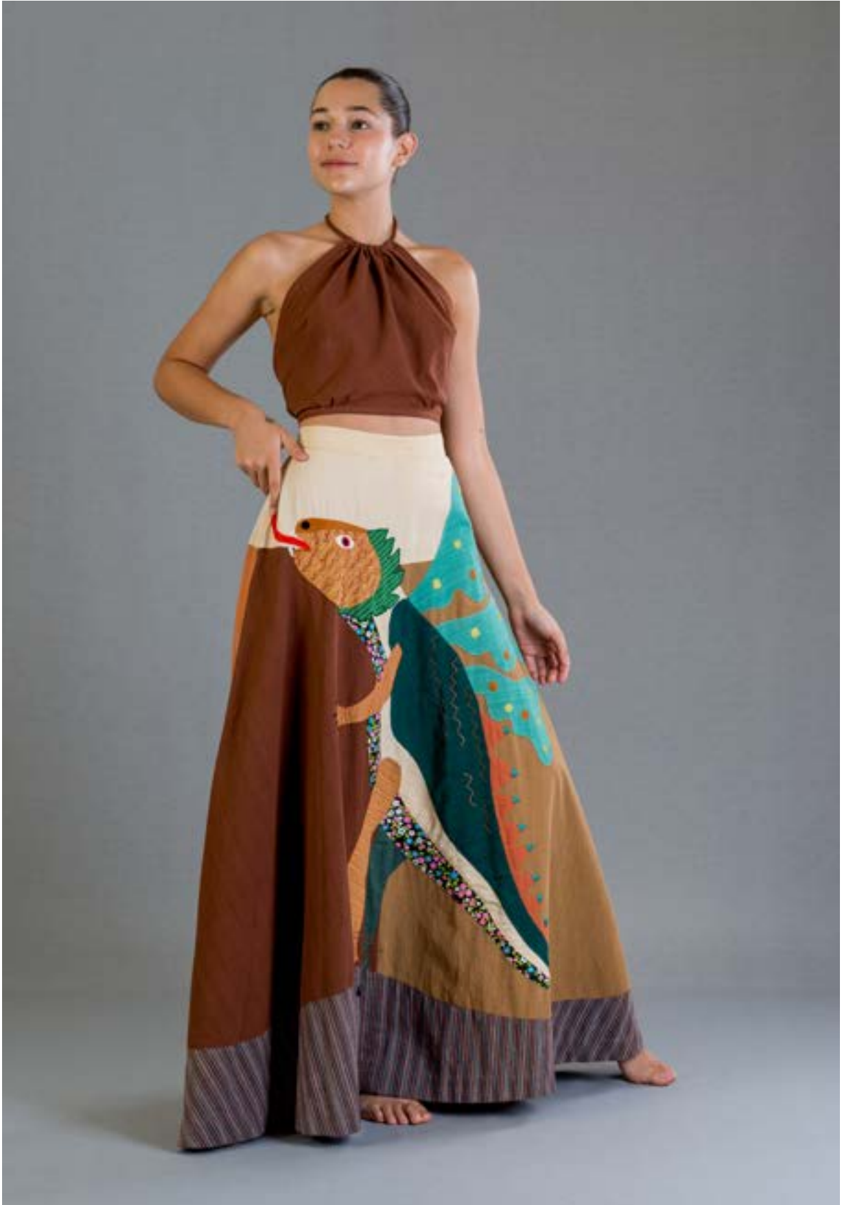
55. Top: "W 10 B" design by Gonzalo Bauer for Girasol, c. 1967 Cotton manta Skirt: Design by Gonzalo Bauer for Girasol, c. 1967 Cotton manta, appliqué, hand embroidery