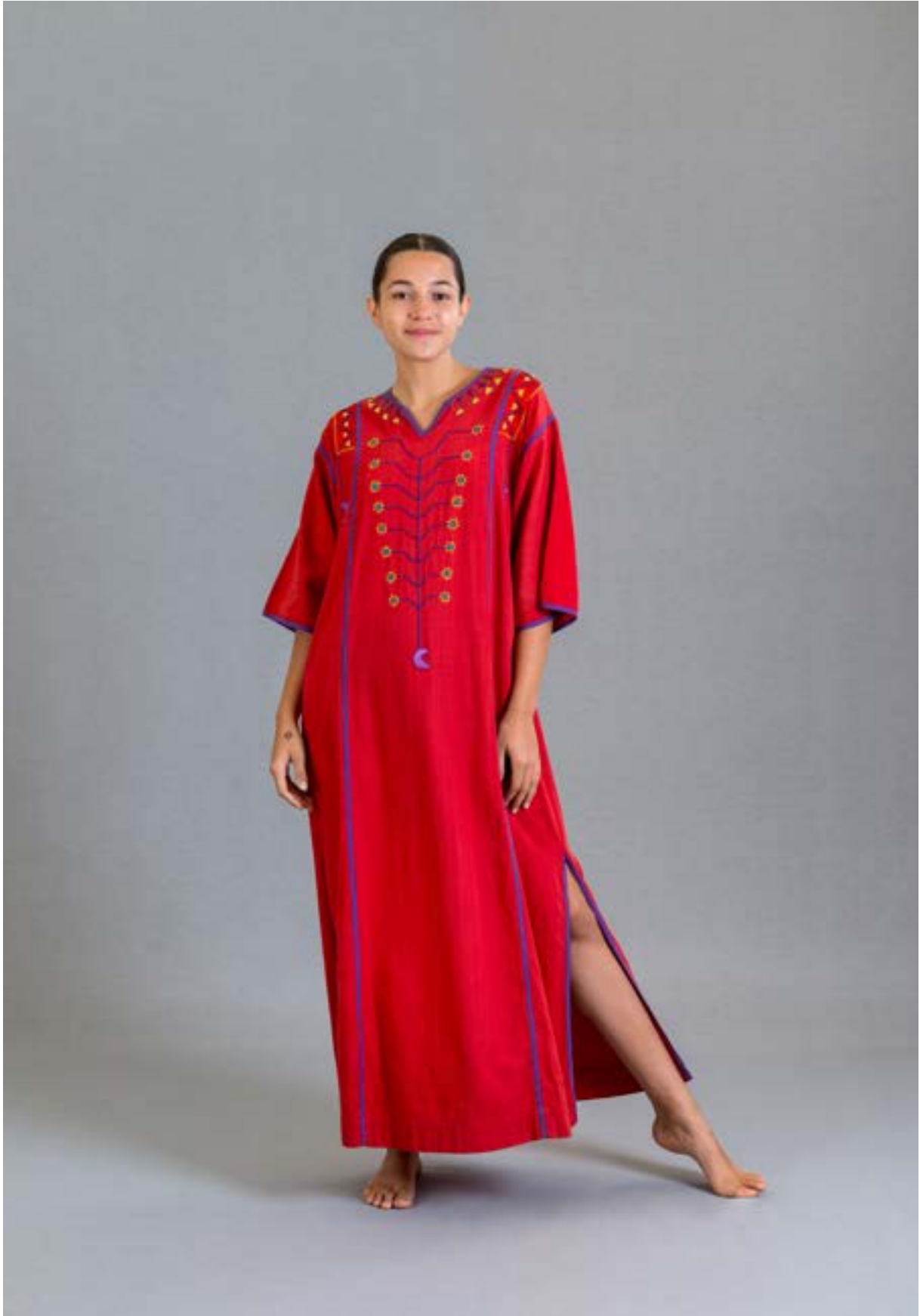
96. Design by Papaya, c. 1970 Cotton manta, hand embroidery