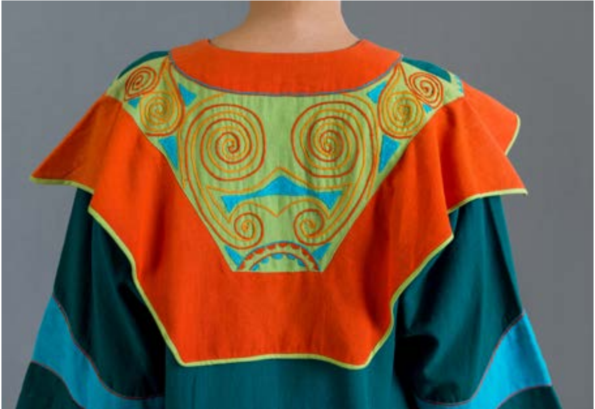
39. Design by Josefa Ibarra, detail hand embroidery