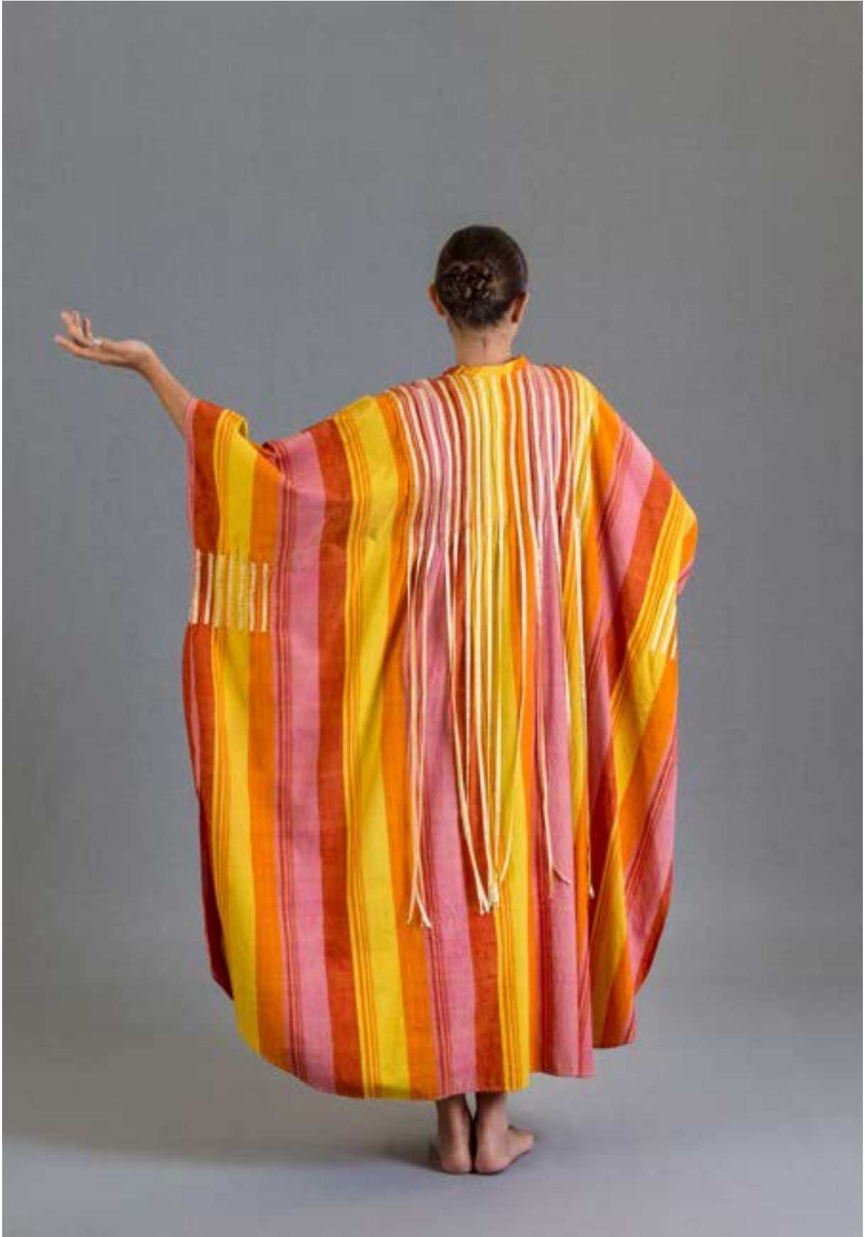
42. Design by Josefa Ibarra for Dell, c. 1970 (back view) Cotton manta, satin ribbon, appliqué, hand embroidery