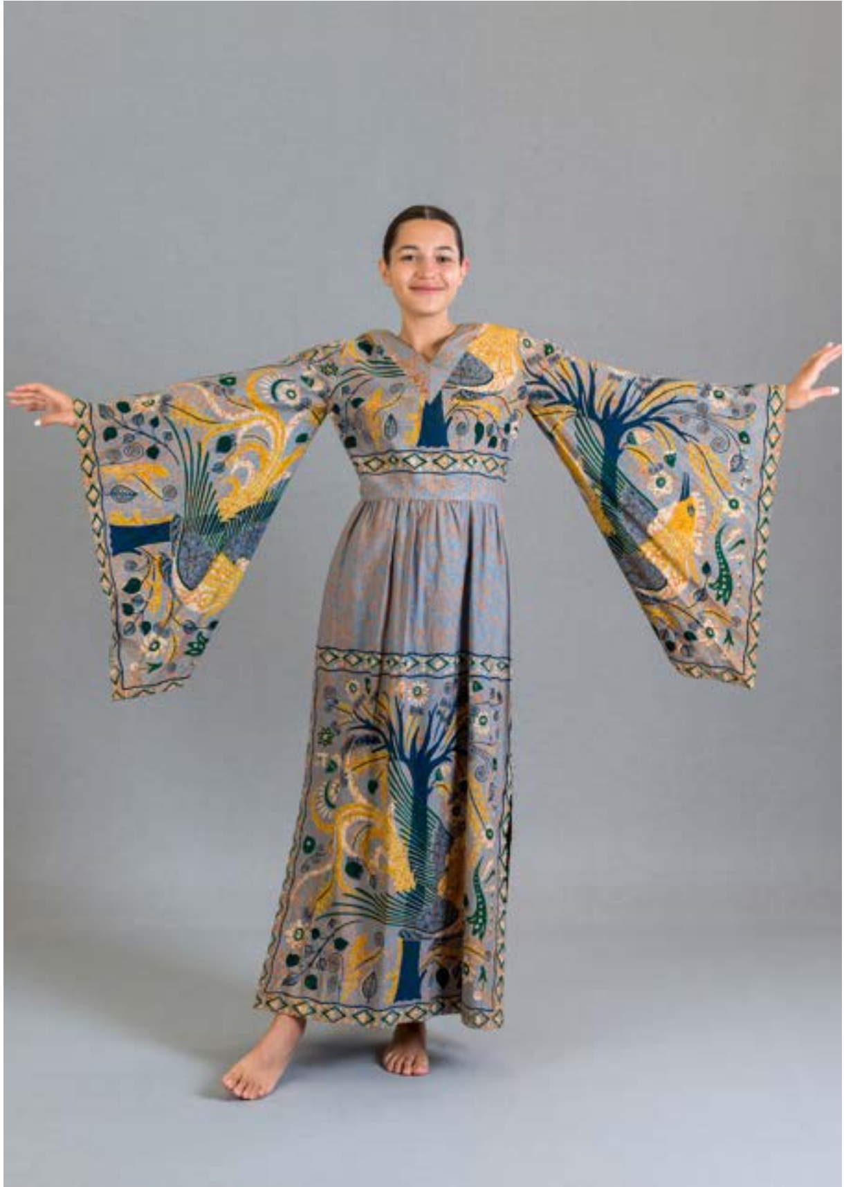
70. Design by Telas Escalera, c. 1968 Cotton batik