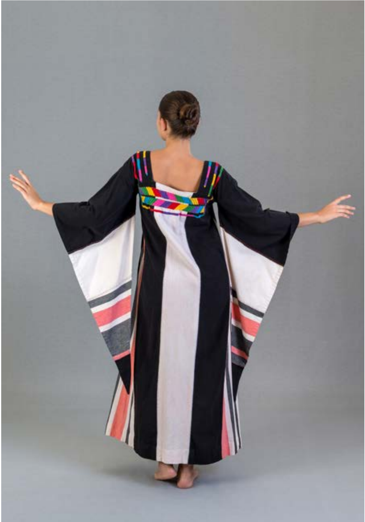
33. Design by Josefa Ibarra, c. 1970 (back view) Cotton manta, appliqué, hand embroidery