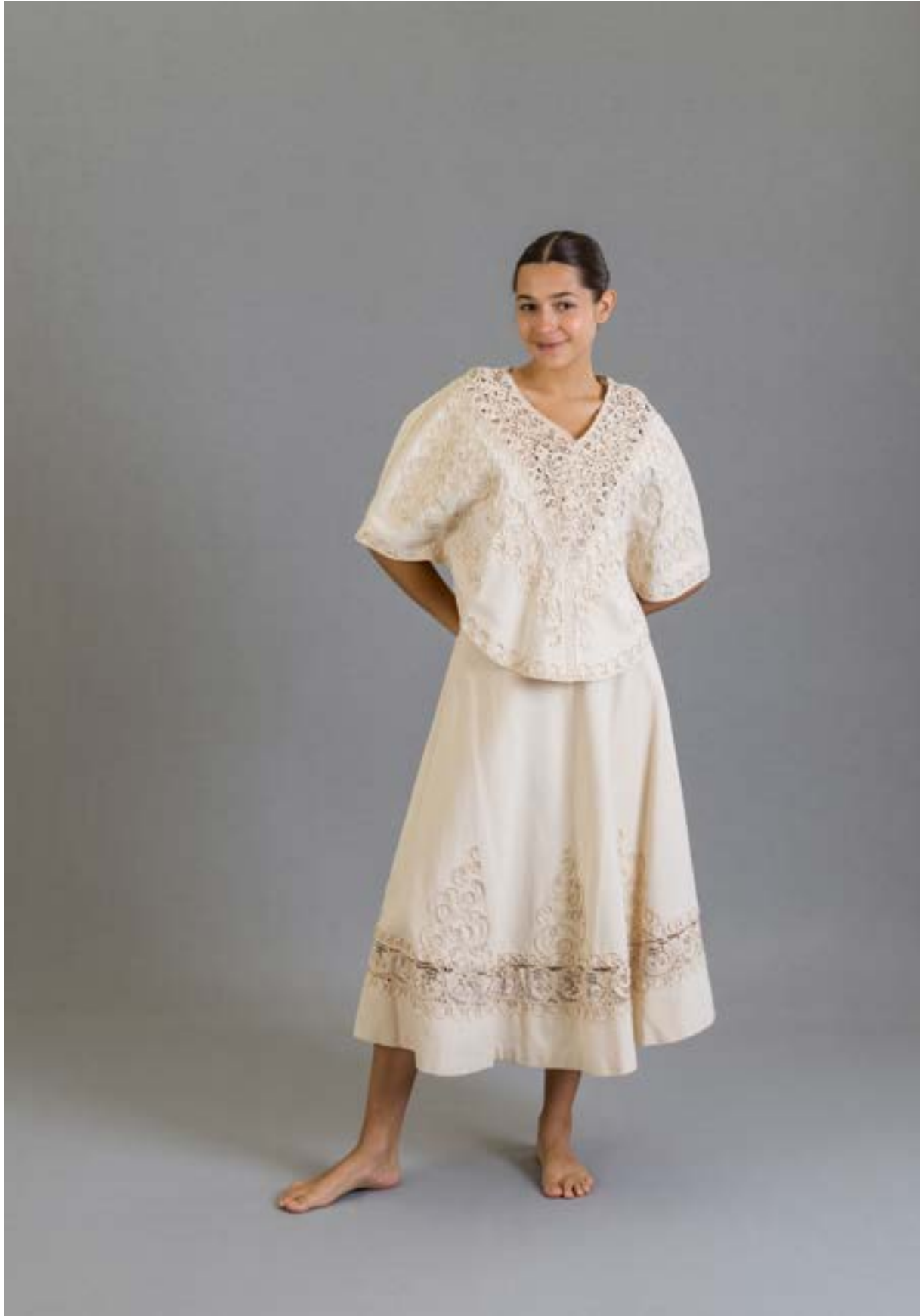
97. Ensemble by unknown designer, c. 1970 Cotton manta, lace, cotton soutache appliqué