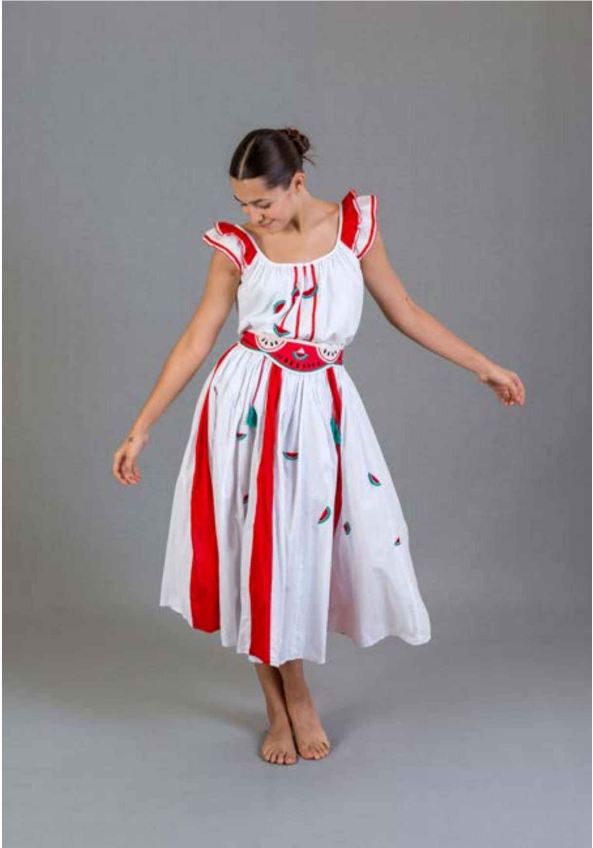
84. Ensemble design by Irene Pulos, c. 1980 Cotton manta, appliqué, hand embroidery