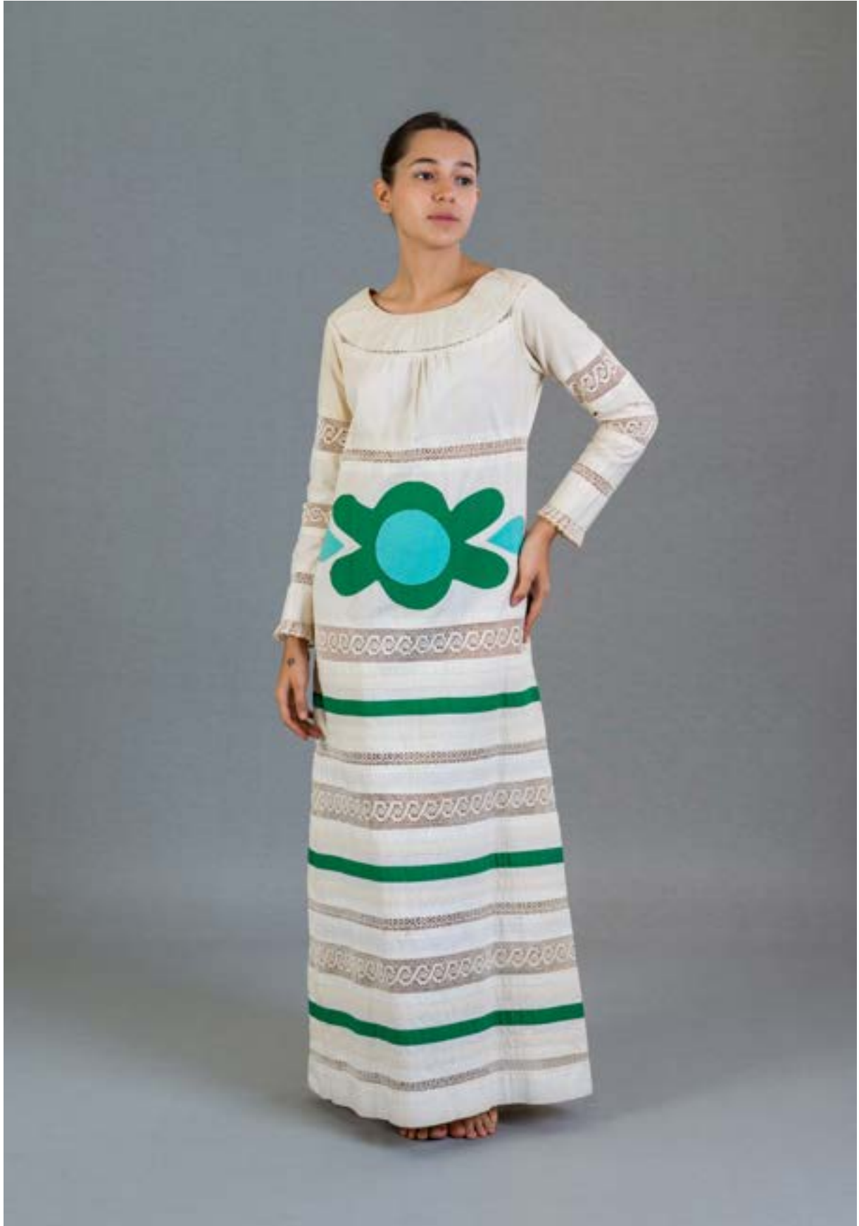
68. Design by Georgia Charuhas, c. 1965 Cotton manta, satin ribbon, lace, appliqué, hand embroidery