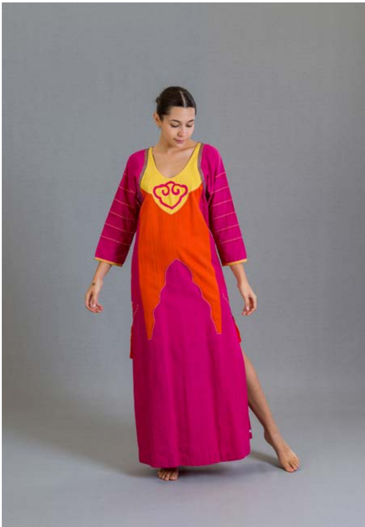
38. Design by Josefa Ibarra, c. 1970 Cotton manta, appliqué, hand embroidery, tassels