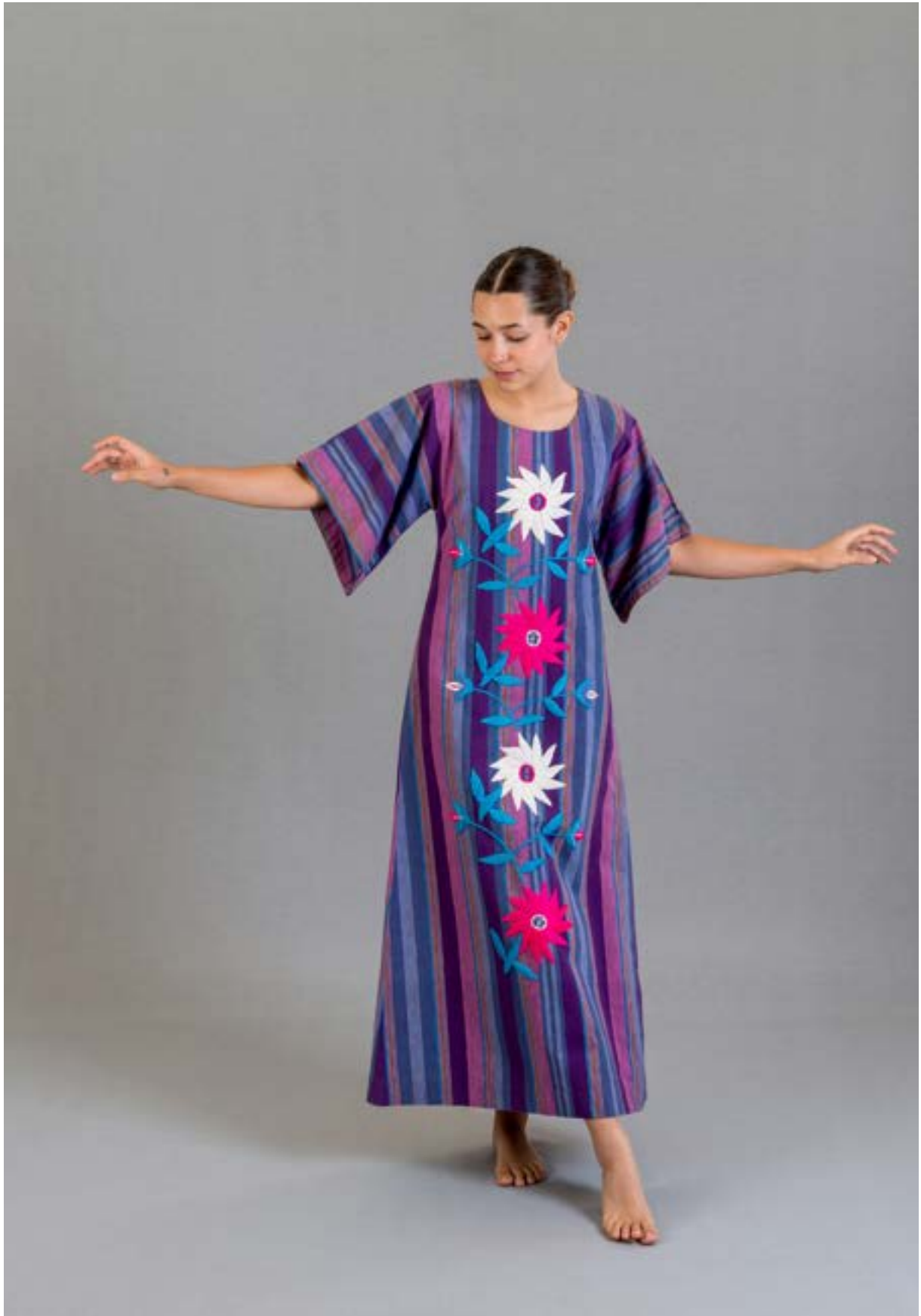
93. Design by Jacaranda, c. 1970 Cotton manta, hand embroidery