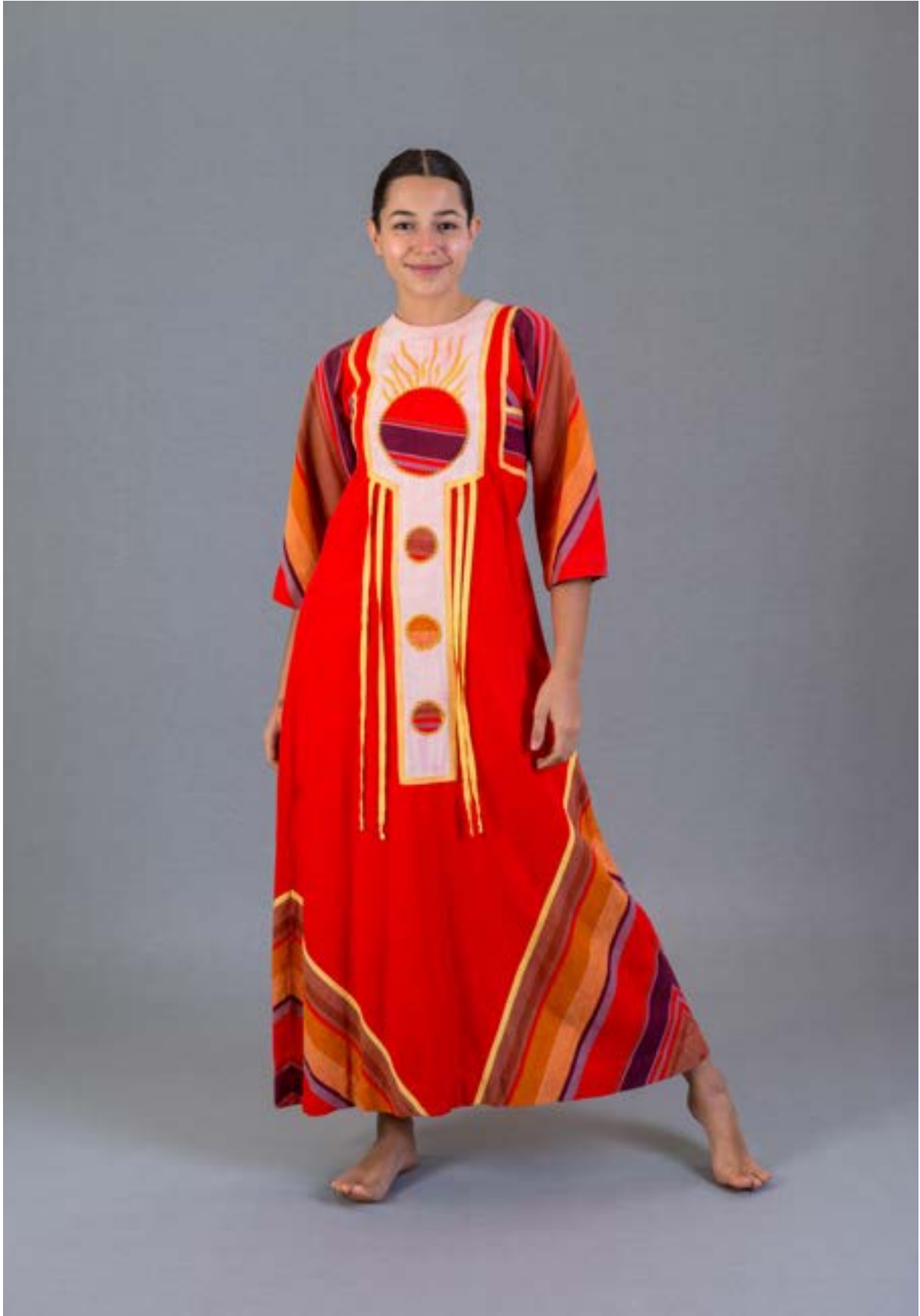
11. Vercellino Designs, c. 1968 Cotton manta, satin ribbon, appliqué, hand embroidery