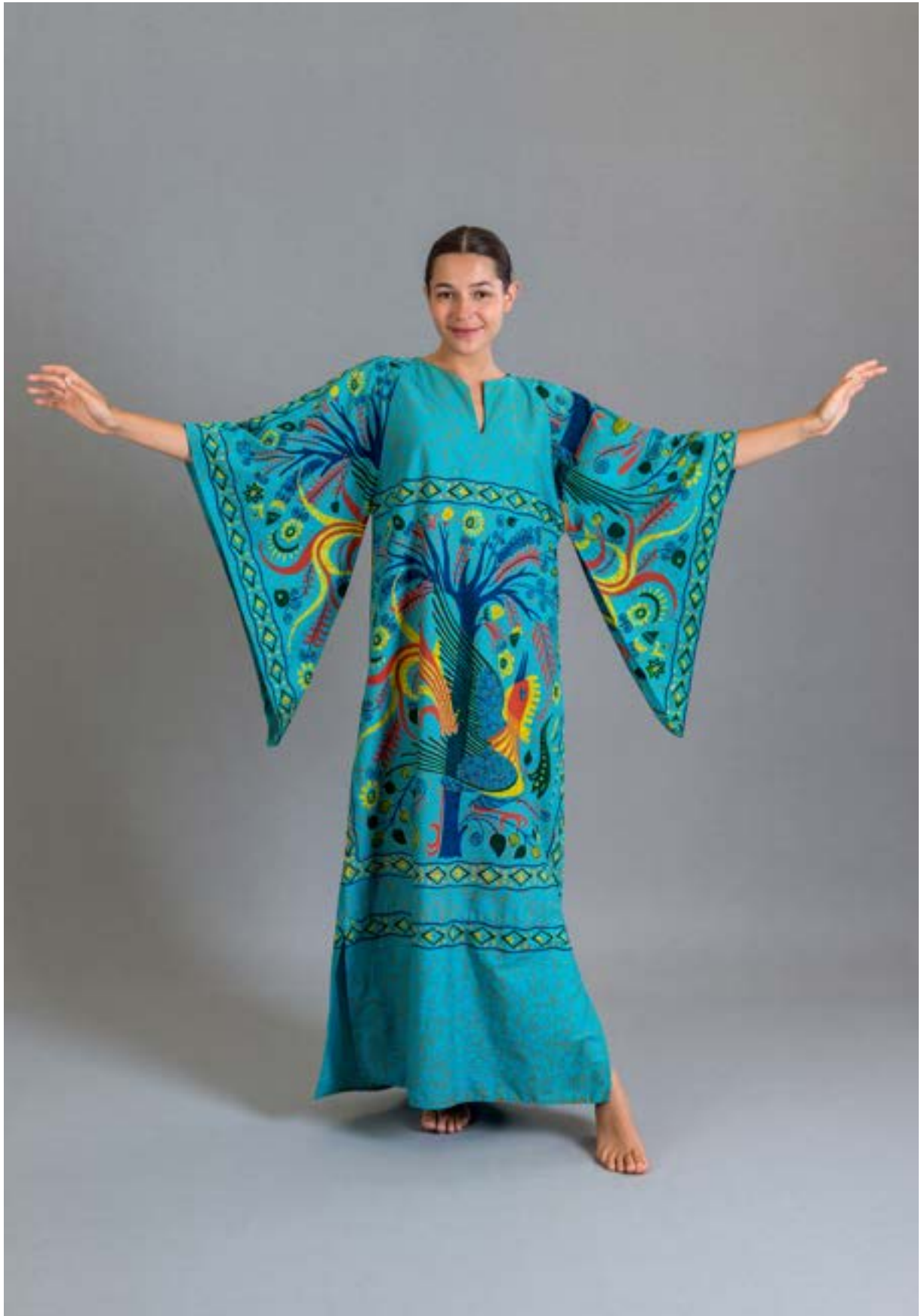
74. Design by Telas Escalera, c. 1968 Cotton batik