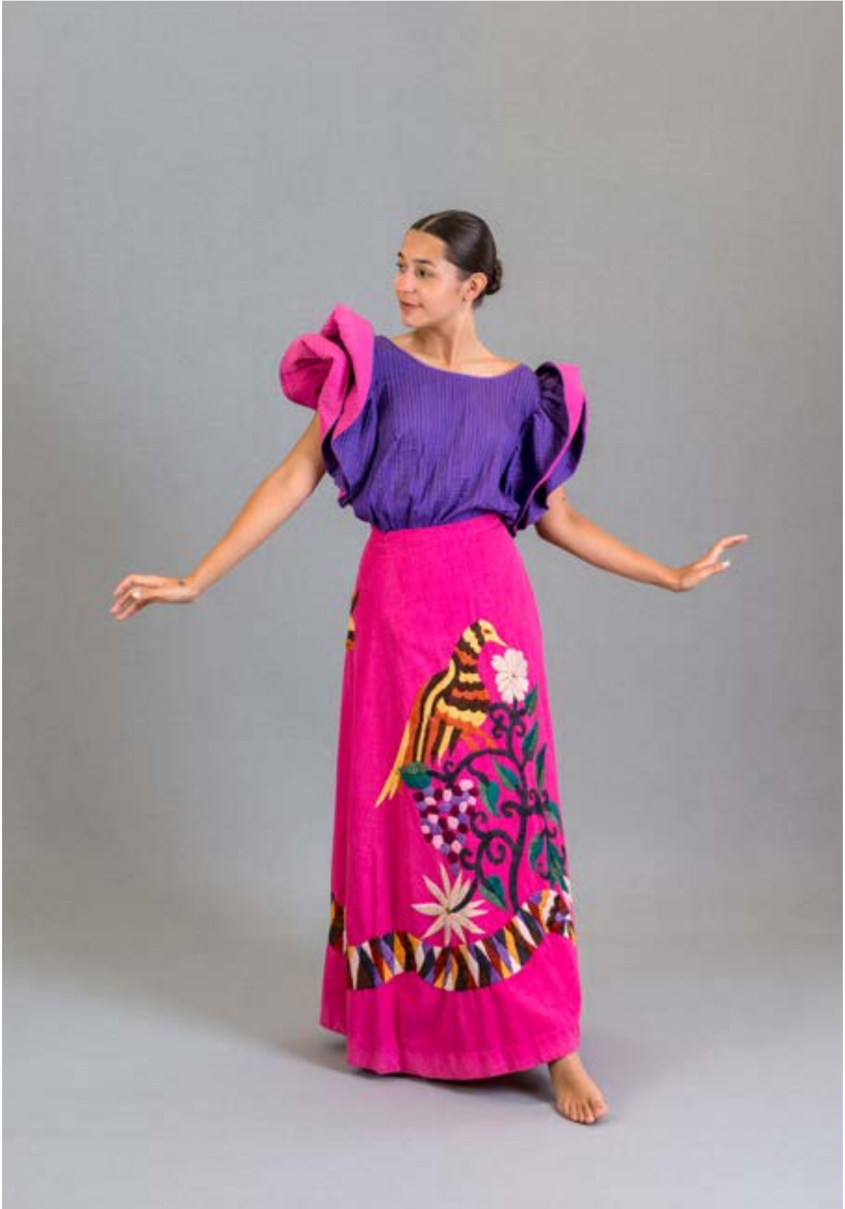
58. Top: Design by Tachi Castillo, c. 1970 Cotton pin tuck Skirt: Design by Gonzalo Bauer for Girasol, c. 1970 Cotton manta, appliqué, hand embroidery