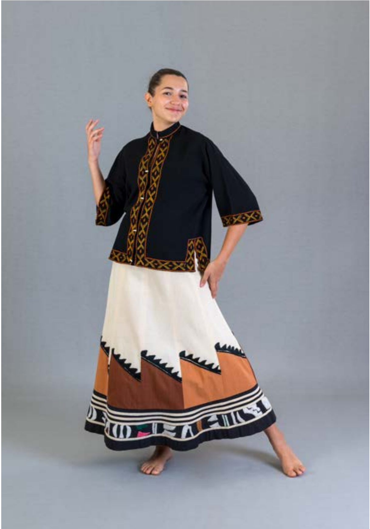
61. Top: Design by Jacaranda, c. 1962 Cotton, appliqué, hand embroidery Skirt: Design by Gonzalo Bauer for Girasol, c. 1968 Cotton manta, appliqué, hand embroidery