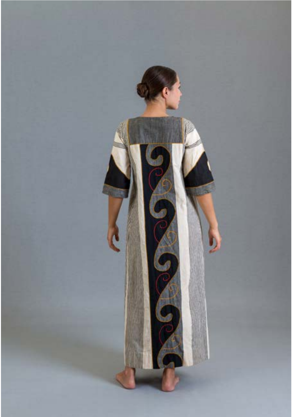
43. Design by Josefa Ibarra, c. 1980 (back view) Cotton manta, appliqué, hand embroidery