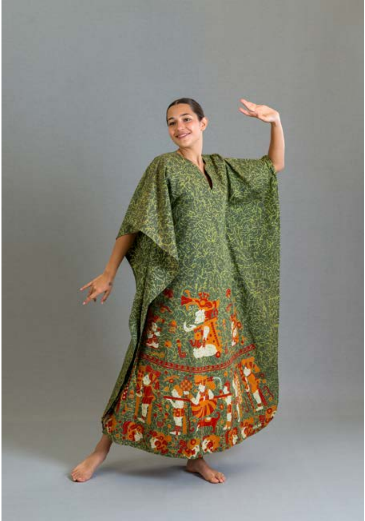
73. Design by Telas Escalera for Del Marqués, c. 1970 Cotton batik