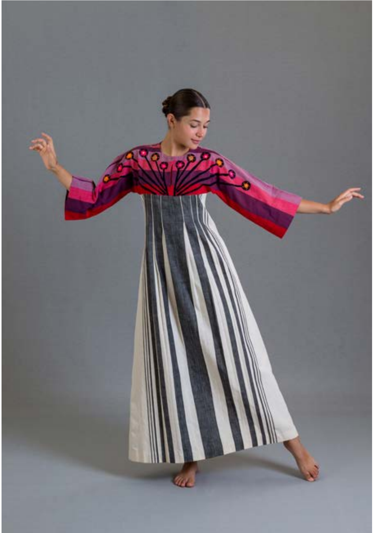
76. Design by Telas Tlaquepaque, c. 1970 Cotton manta, appliqué, hand embroidery