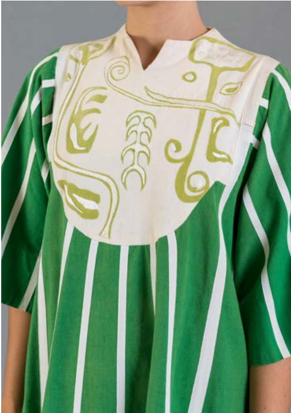
9. Vercellino Designs, detail hand embroidery