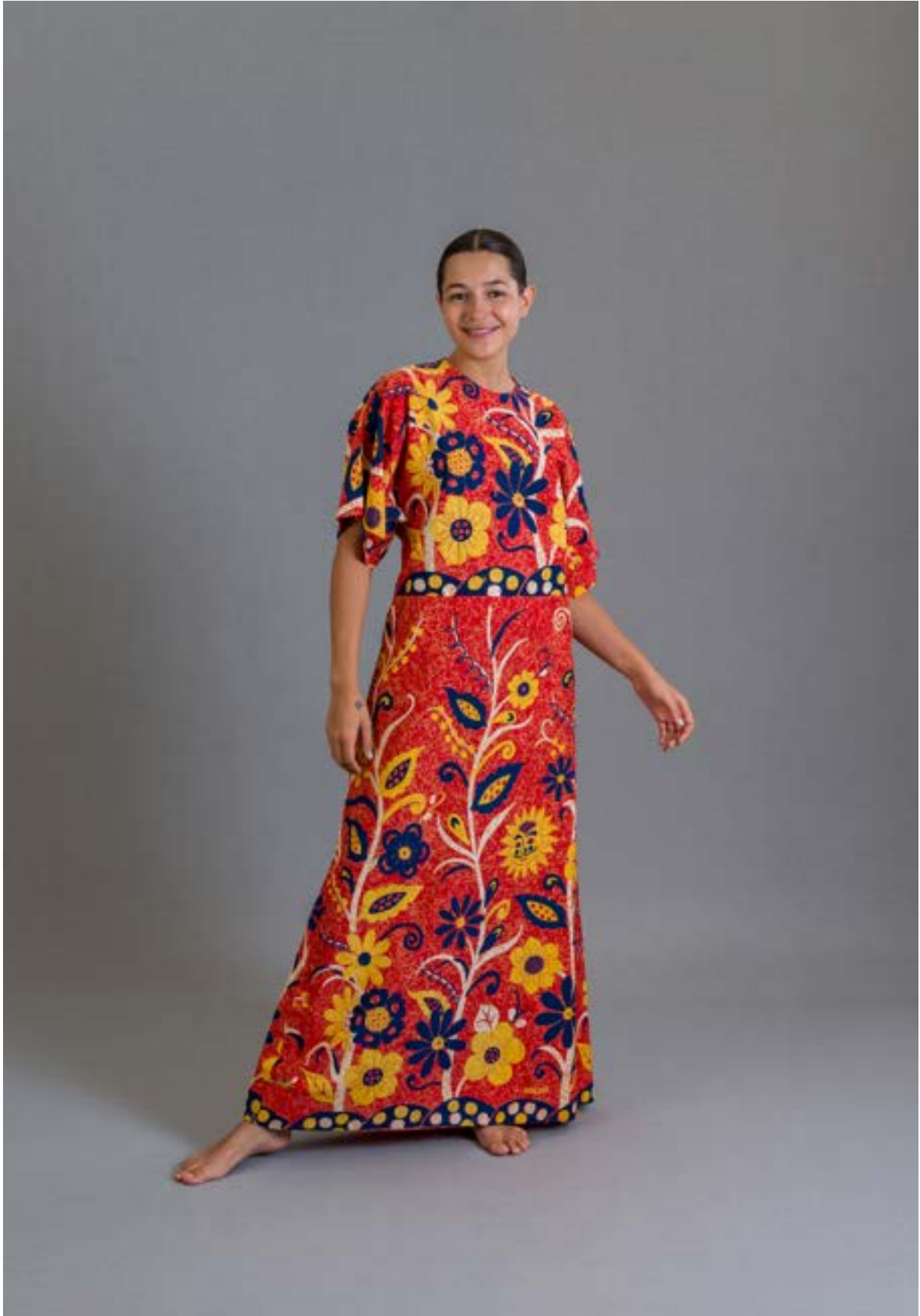
69. Design by Telas Escalera, c. 1968 Cotton batik