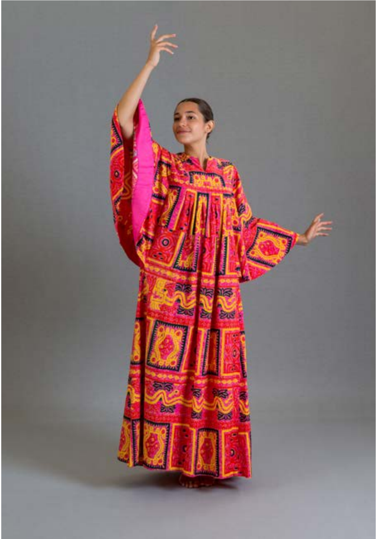
75. Design by Telas Escalera, c. 1970 Cotton batik